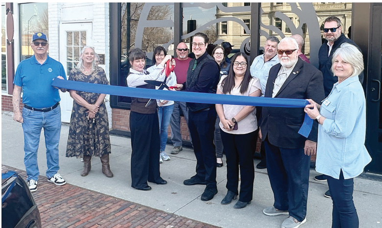
The Adel Partners Chamber of Commerce held a ribbon cutting for Great White Buffalo Public House, 815 Main St., on March 27 in Adel.