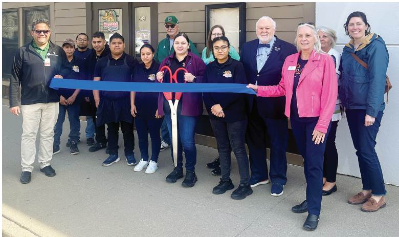
The Adel Partners Chamber of Commerce held a ribbon cutting for Mi Casa Jalisco, 909 Main St., on April 8.