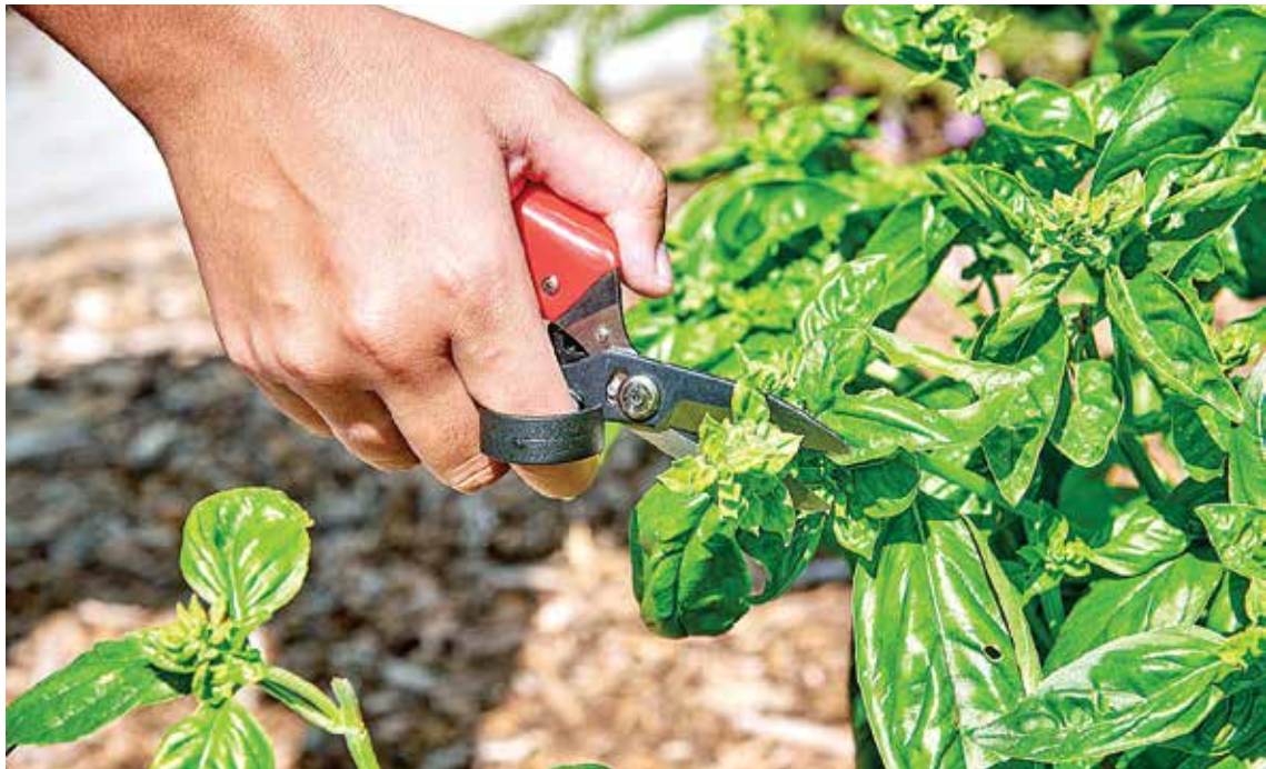
A gardener uses an Ergocut dead header in the garden.

The type of flower will influence how and where to make the cut. In general, remove the stem of faded blooms back to the first set