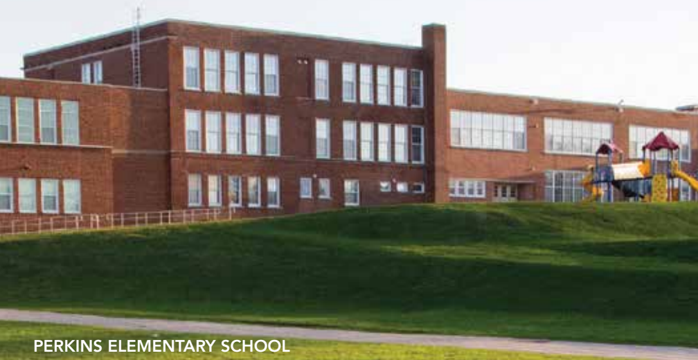
PERKINS ELEMENTARY SCHOOL