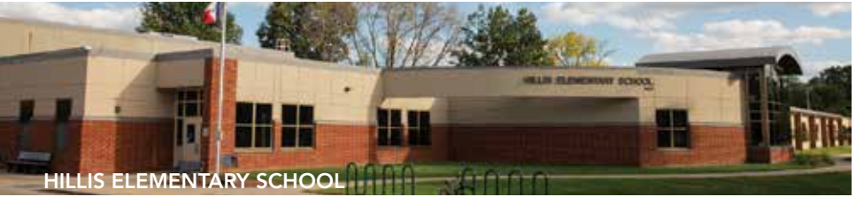
HILLIS ELEMENTARY SCHOOL

In the neighborhood and in nearby 50310 zip code area