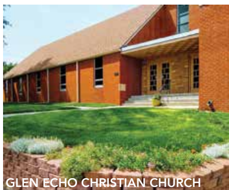
GLEN ECHO CHRISTIAN CHURCH