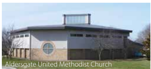
Aldersgate United Methodist Church