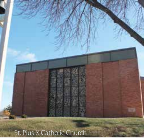
St. Pius X Catholic Church