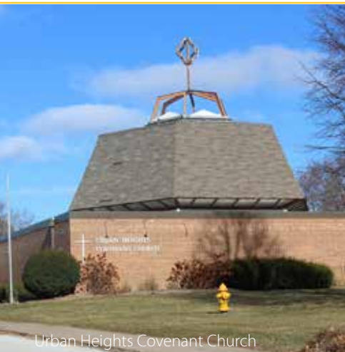
Urban Heights Covenant Church