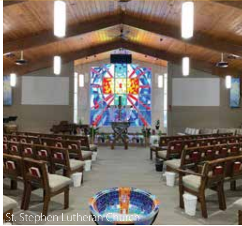
St. Stephen Lutheran Church