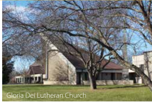
Gloria Dei Lutheran Church