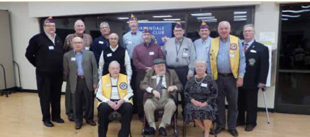
Urbandale Lions Club celebrated its 75th anniversary.