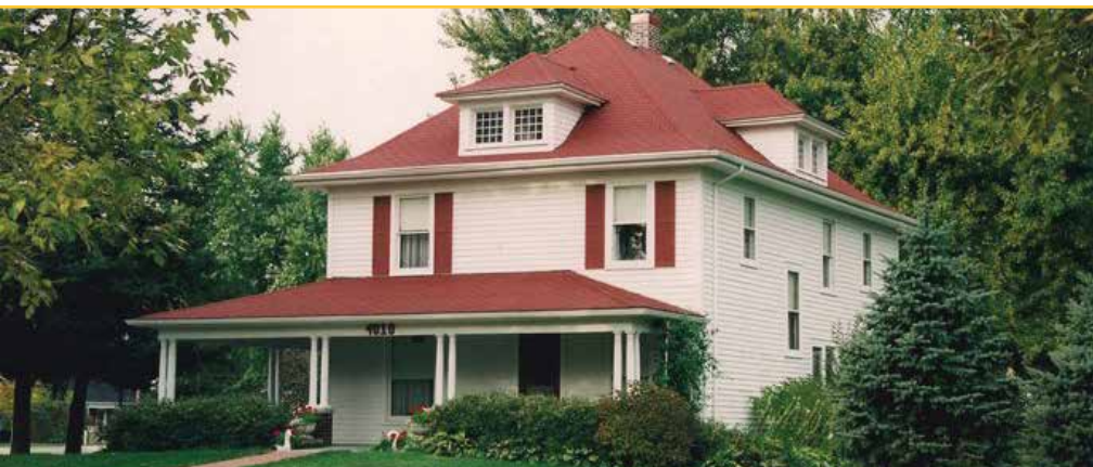
The Olmsted-Urban House, operated by the Urbandale Historical Society, was built in 1904.

being added to the National Register of Historic Places in 2019.