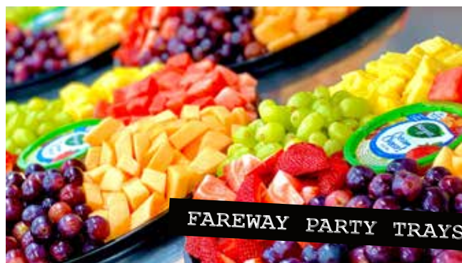
FAREWAY PARTY TRAYS