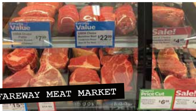
FAREWAY MEAT MARKET