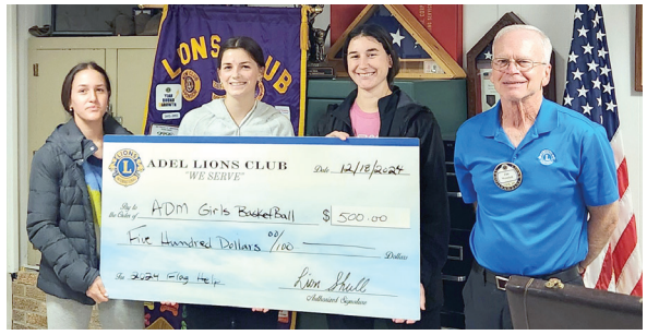
The club presented $500 to the ADM girls basketball program. ■