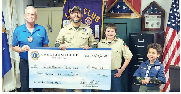
The club presented $900 to Adel Cub Scouts.