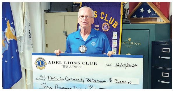
The club presented $3,000 to De Soto Community Betterment.