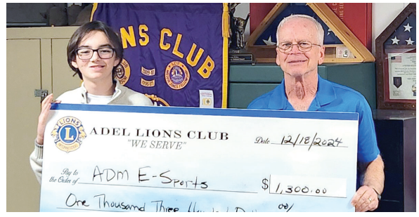
The club presented $1,300 to the ADM E-sports program.

THE ADEL LIONS CLUB DONATED TO LOCAL GROUPS FOR ASSISTING THE CLUB WITH ITS FLAG PROGRAM IN 2024.