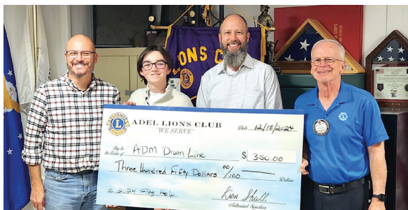
The ADM Drum Line received $350. ■

See additional photos in next week's issue.