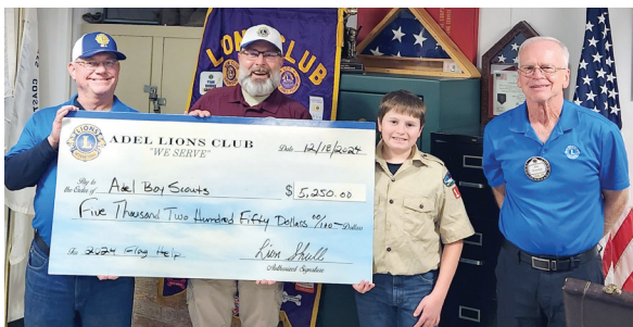
The Adel Boy Scouts received $5,250.

THE ADEL LIONS CLUB DONATED TO LOCAL GROUPS FOR ASSISTING THE CLUB WITH ITS FLAG PROGRAM IN 2024.