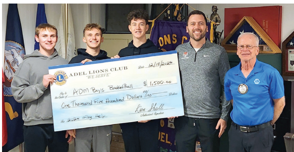
ADM Boys Basketball received $1,500.