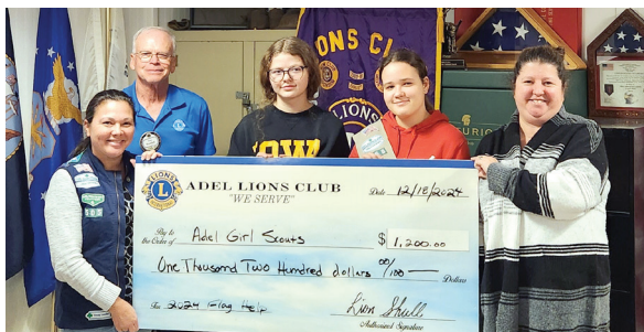
The Adel Girl Scouts received $1,200.