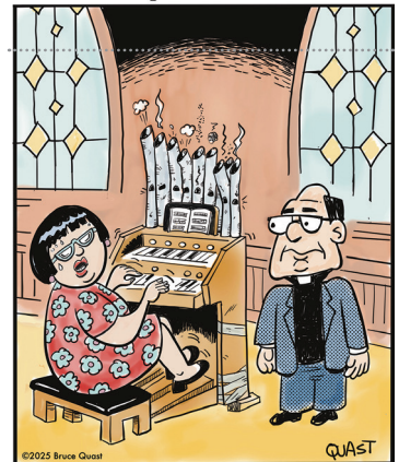
"We're gonna need an organ donor!"

WE WILL RUN YOUR JOHNSTON NEWS ITEMS FOR FREE.