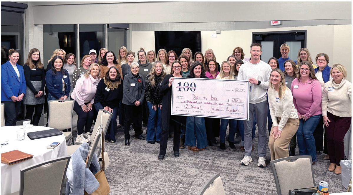
100 WOMEN WHO CARE SUPPORT DOROTHY'S HOUSE: On Feb. 20, Northwest Metro (Johnston and Grimes) 100 Women Who Care presented Dorothy's House with a check for $6,110. If you want to learn more about this group, reach out to someone you know in this picture. Dorothy's House is a safe place for survivors of human trafficking, exploitation and prostitution to discover their healing journeys through the practice of life. Customized programs are designed to provide complete support for all survivors, regardless of race or gender. ■