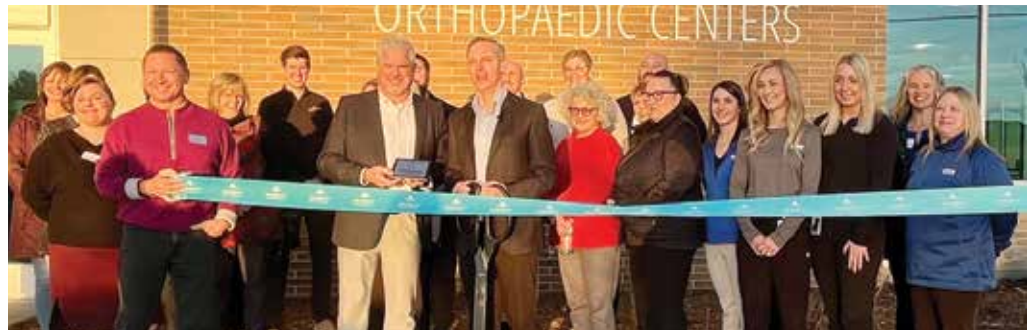
A ribbon cutting was held for DMOS Orthopaedic Centers, 350 N.E. 36th St., on Jan. 16.