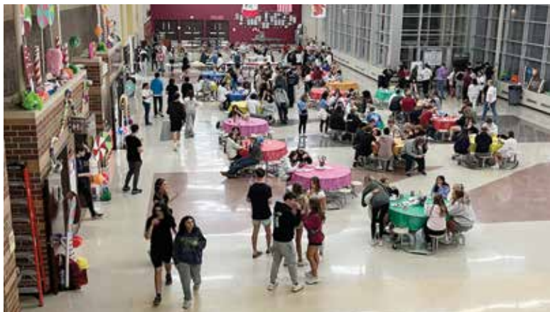
After Prom attendees enjoy food, games, prizes and fun.

Community comes together to offer a fun, safe experience for Ankeny teens.