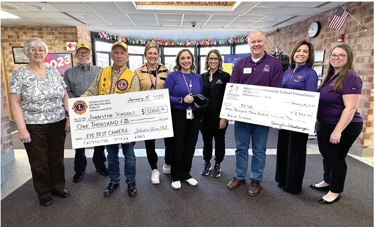
FOUNDATION PRESENTS FUNDS FOR VISION SCREENER: School nurses received a $7,360 grant from the Johnston Community School Foundation for a second vision screener to share among all school buildings. The Johnston Lions Club contributed $1,000 for the project, while Advanced Eye Care Center PC donated $500. ■