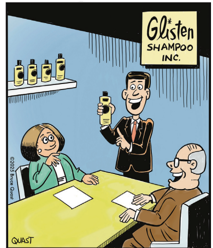
“Here’s our plan to increase sales- change the instructions to read: Lather, rinse, repeat, then repeat again!”