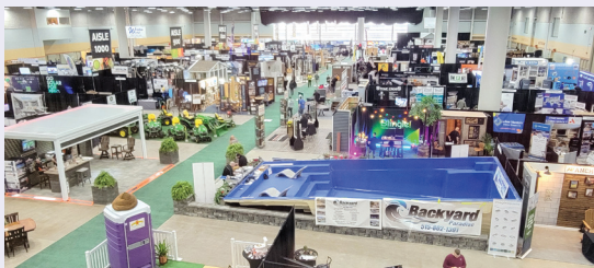
Des Moines Home and Garden Show