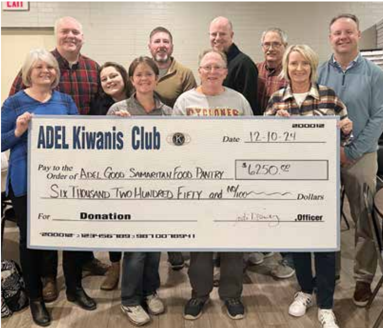
KIWANIS CLUB DONATES TO FOOD PANTRY: The Adel Kiwanis Club made a $6,250 donation to the Adel Good Samaritan Food Pantry at the weekly club meeting at Patrick's Restaurant in Adel on Dec. 10. ■