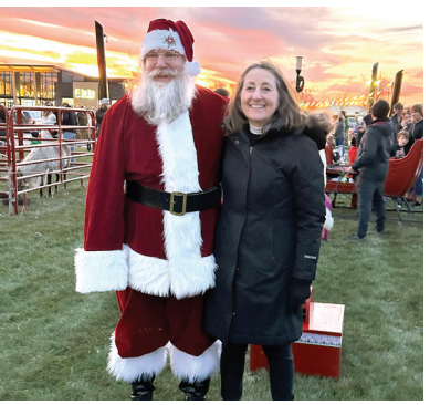
Santa and Mayor Paul Dierenfeld