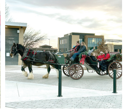
Holiday carriage rides were enjoyed by families.