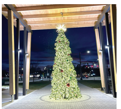
The tree lighting was held.