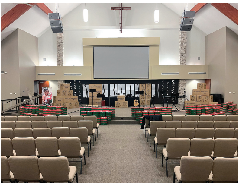
Shoebox gifts are stacked at the altar of New Hope Church in Adel before being delivered to Samaritan's Purse.

Tens of thousands of volunteers from local churches around the world partner with Samartian's Purse to