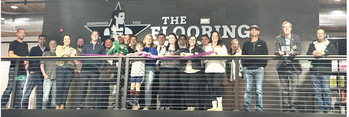
RIBBON CUTTING FOR THE FLOORING GUYS: Johnston Chamber held a ribbon cutting for the new location of The Flooring Guys, 4925 N.W. Johnston Drive, Johnston, on Nov. 12. ■