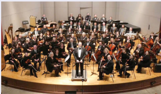
Des Moines Community Orchestra