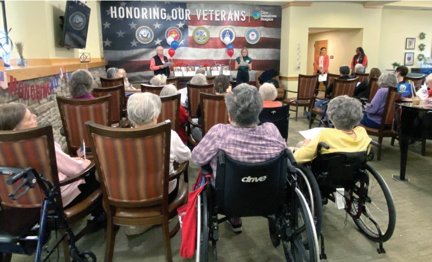
Edencrest at Green Meadows celebrated Veterans Day by honoring veteran residents on Nov. 11.