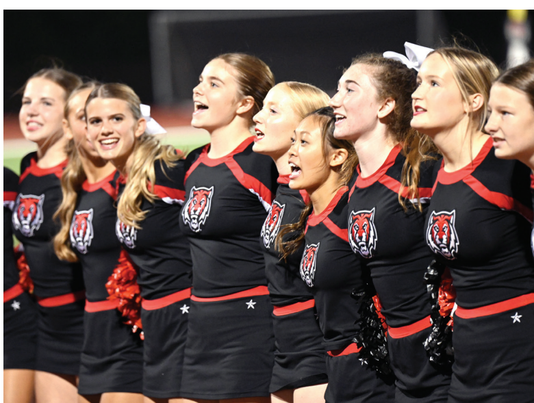
THE ADM HOMECOMING PEP RALLY WAS HELD ON OCT. 3: The ADM Cheerleaders participated in the pep rally. ■