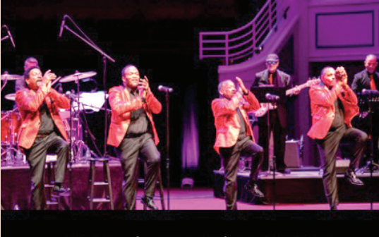
A Motown Christmas will be at Hoyt Sherman Place on Nov. 12 at 7 p.m.