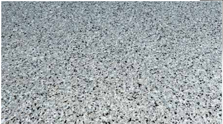
Char Robinson's new garage floor is aesthetically pleasing and easy to clean.

fabulous job, and I can't tell you how many compliments I get on my driveway. It's silly, I mean, but it looks fabulous."