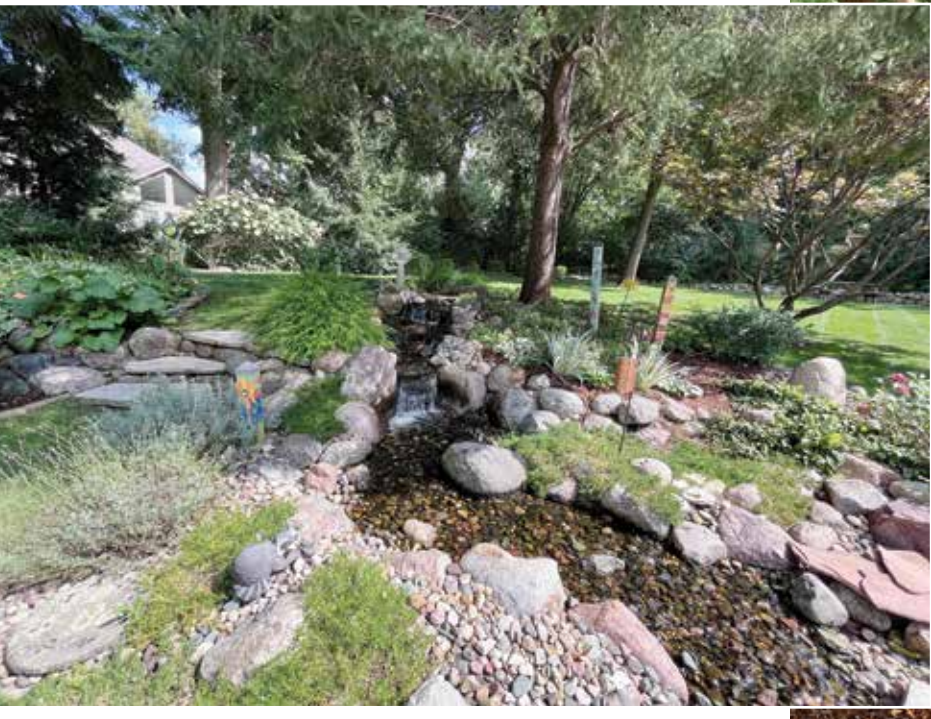
A pond at the McIlhon home was replaced with an easier to maintain waterfall.