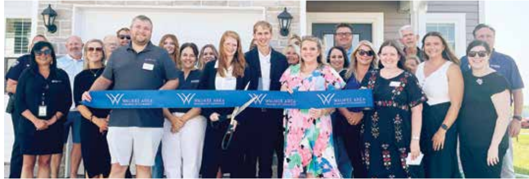
Waukees Area Chamber of Commerce hosted a ribbon cutting for Painted Woods Villas, 3681 Jasmine Lane, on July 30.