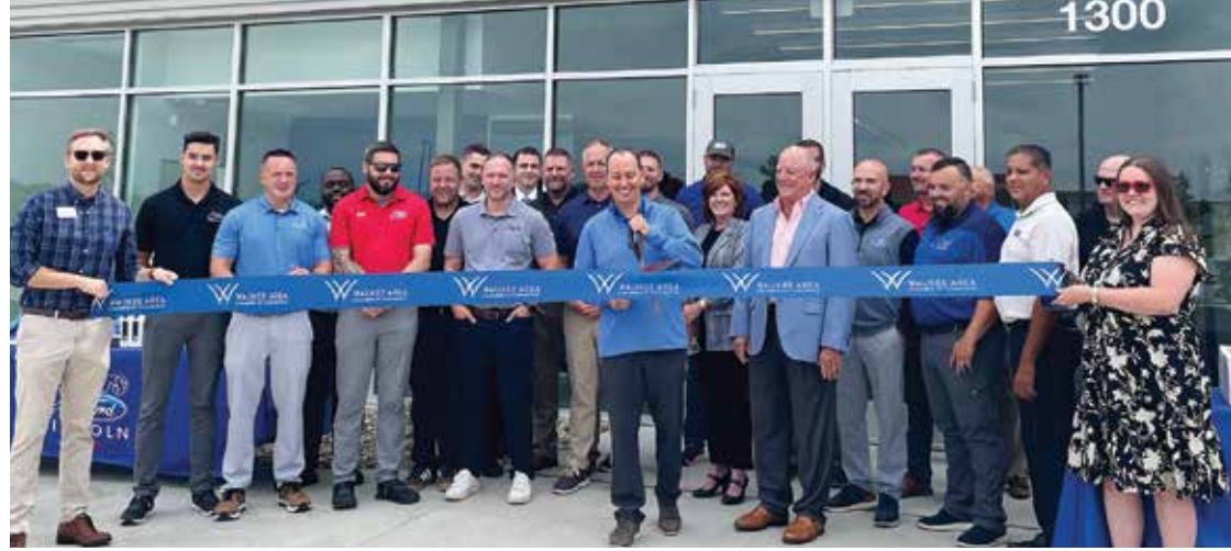
Waukee Area Chamber of Commerce hosted a ribbon cutting for Stivers Ford PRO Elite Commercial Service Center, 1300 S.E. Stoneridge Drive, Aug. 14.