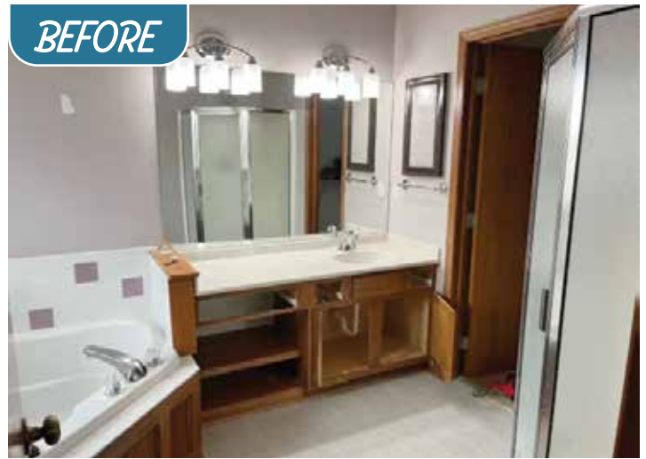
The Youngers’ outdated bathroom needed updating.

A dartboard, couch and large screen TV ensures entertainment for their friends. The couple watches Iowa State University sports. (They met while attending ISU.) Storage areas round out the basement.