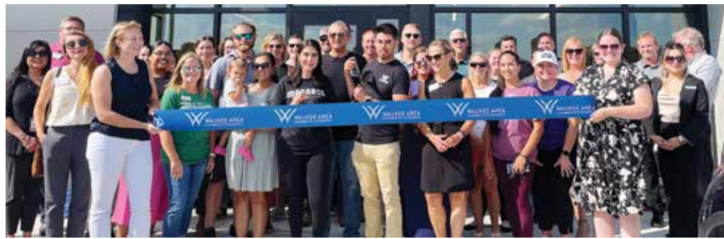
Waukees Area Chamber of Commerce hosted a ribbon cutting for Monarca Gourmet Paletas (the Art of Ice Cream), 2856 Grand Prairie Parkway, Suite 100, on Aug. 28.