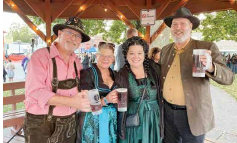
Wauktoberfest features the tapping of the Golden Keg and German-themed fun, beer and food.

"We had a variety of all ages who showed up in costumes, such as drendels and lederhosen. Some really get into the costumes."