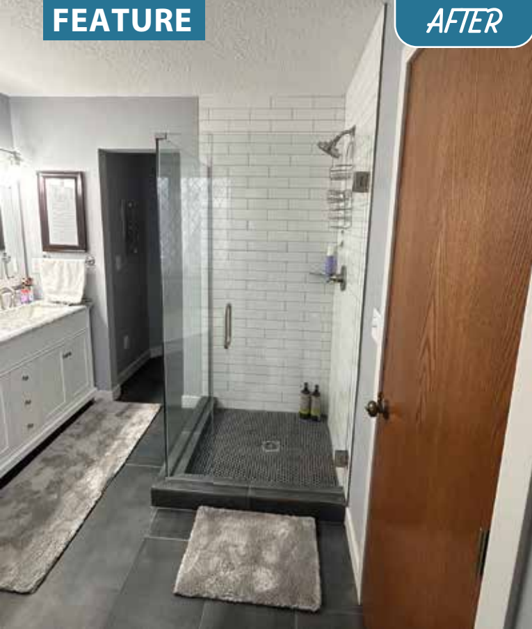
The Youngers of Waukee redid their master bathroom, putting in a double vanity, a larger shower and taking out an old jacuzzi.