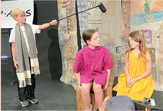
The Des Moines Playhouse classes