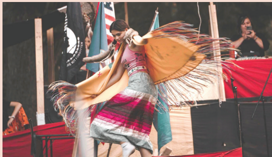
Multicultural Pow Wow