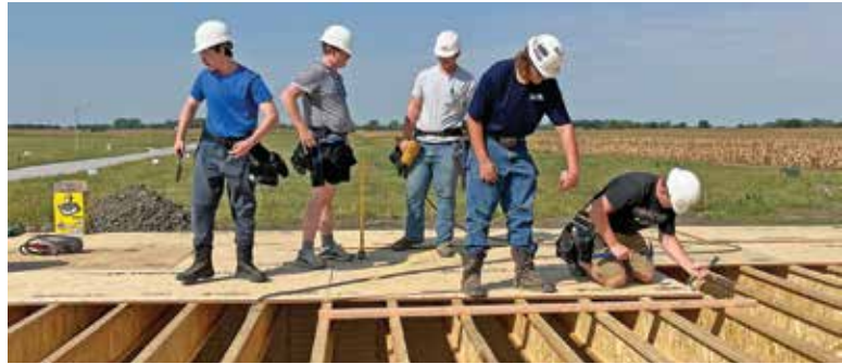
Students in the Construction Technology program build a house.

Project provides experience on a job site.