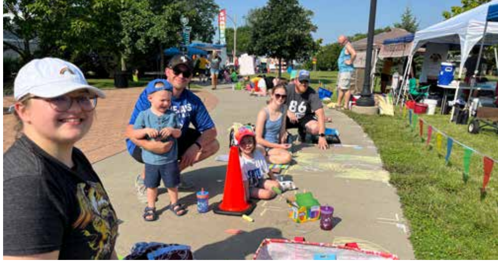
A group chalking designs at the Sidewalk Chalk Festival on July 13.

The 10th Annual Sidewalk Chalk Festival was July 13 at The Depot in Bondurant.