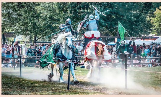
Fall Faire Renaissance Faire