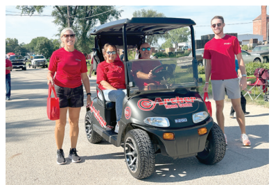
Archer Home Center