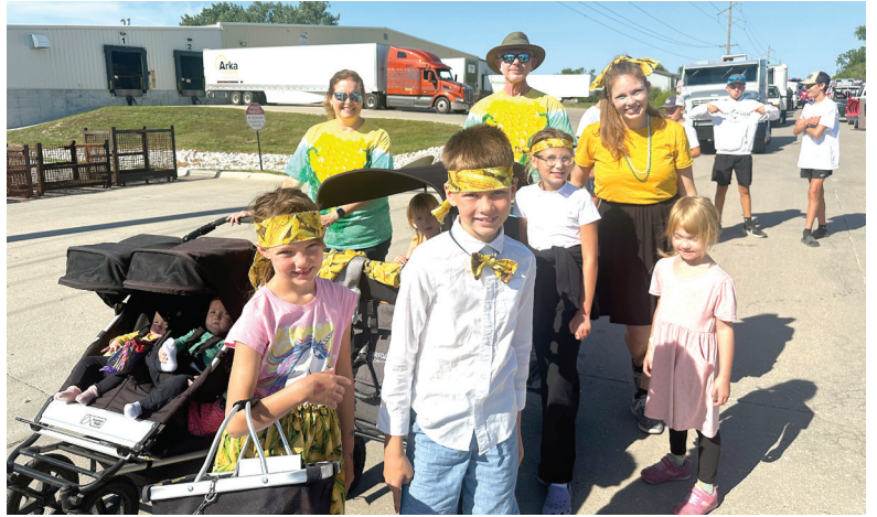
SWEET CORN FESTIVAL PARADE: Many area businesses had entries in the Adel Sweet Corn Festival Parade Aug. 10. Pictured above is the entry for Noted Studios Music Lessons.