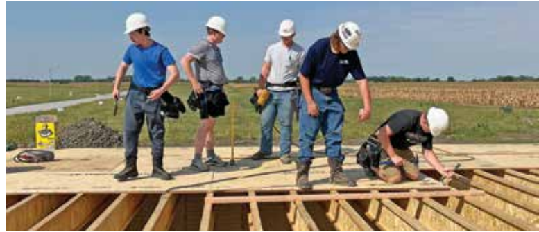
Students in the Construction Technology program build a house.

Project provides experience on a job site.