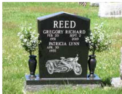
A look of admiration at the remarkable presentation in memory of Wolverine Greg Reed.