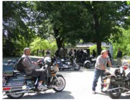
The sun has come out and starting to warm things up at the Kings Mill break.