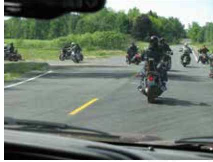
Good separation and moderate speeds make for a sane and sensible ride.