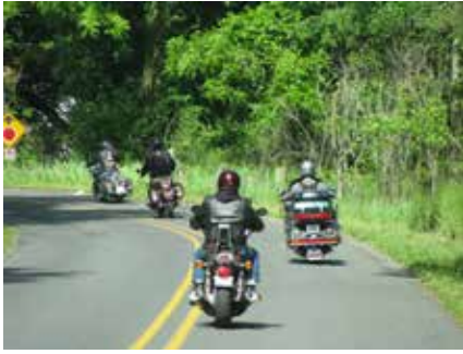
And we're off down the beautiful country roads on a chilly morning.