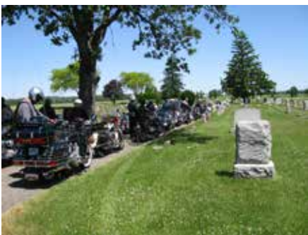
The ride arrives at the Mendon Township Cemetary.