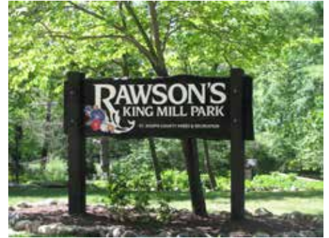
We stop for a break and more bull session at the Rawsons King Mill Park.