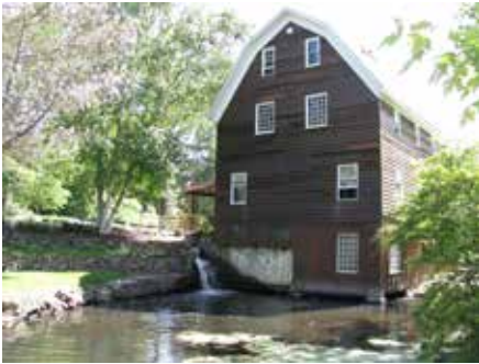
Centerpiece in the park is the well preserved original Kings Mill.