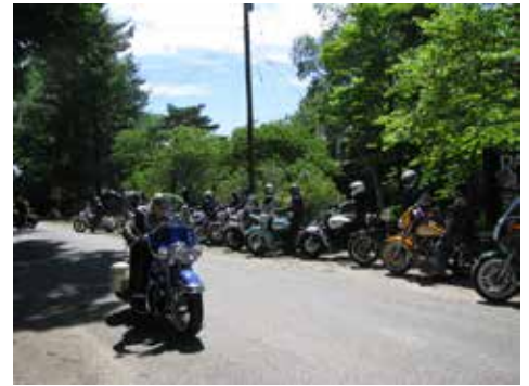
Group hug before moving on from the park.