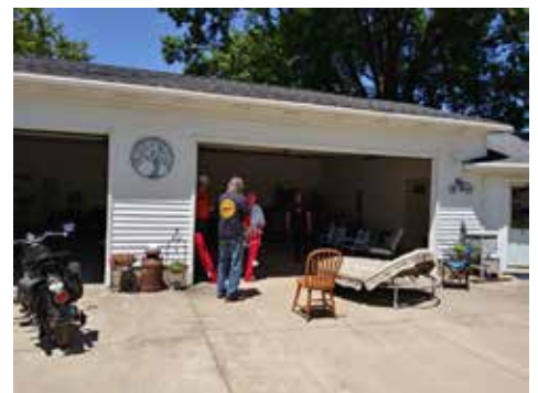
And a relaxing conclusion at Pats home before a cross country ride home.