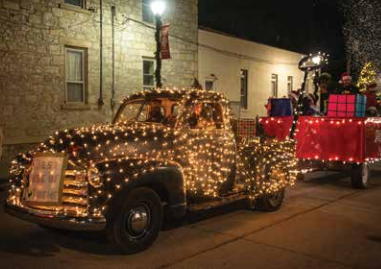
Winterset Festival of Lights.

10 a.m. to 4 p.m. on Saturday. 116 S. First Ave., Winterset Courthouse Square; madisoncounty.com/special-events .