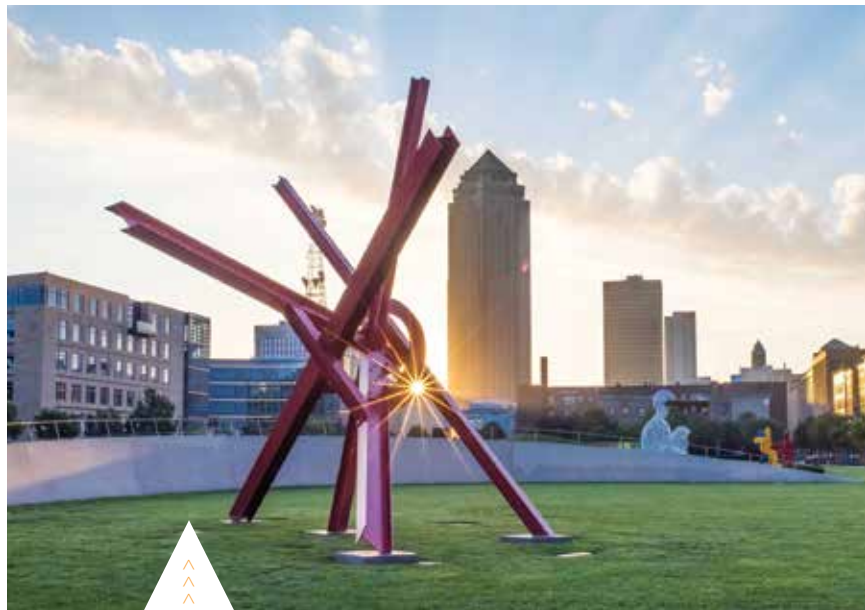
Pappajohn Sculpture Park.