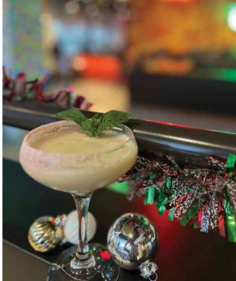
Find beverages on the Peppermint Trail.

DEC. 8-9: Winter Solstice Market. 6-9 p.m. on Friday,