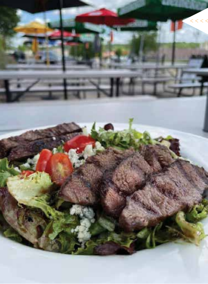
Steak salad on the patio.