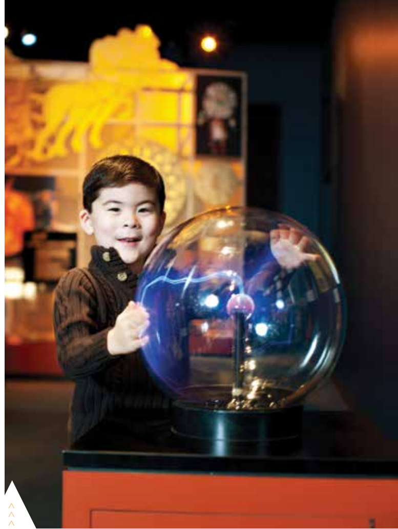
A day full of fun is possible.

DES MOINES PUBLIC LIBRARY DMPL.ORG/GET-CARDED