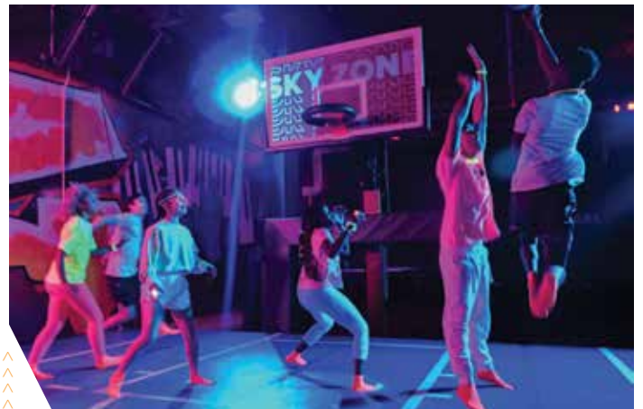
Sky Zone will let your kids blow off steam all winter long.