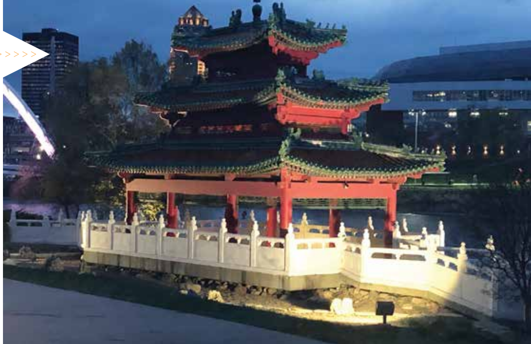
Robert D. Ray Asian Gardens.

Dedicated to former Iowa Governor Robert Ray, the garden is not only a symbol of his humanitarian work in giving Asian refugees and immigrants a safe haven, but to the incredible contributions that those refugees, immigrants and their subsequent families have made to the area. The pathway, pavilion and garden are a must-see when in the city.