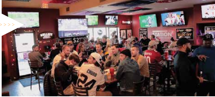
Stop in for tenderloin Tuesday for a sandwich and side for only $10.

Catch the game and catch some vibes at the city's best sports bar as voted by CITYVIEW readers. Enjoy a wide range of classic bar food such as wings, burgers, sandwiches and vegetarian options available for your indulgence, with local and national beers on tap to wash it down.