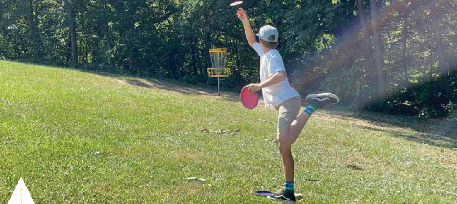
Disc golf provides family fun and exercise.