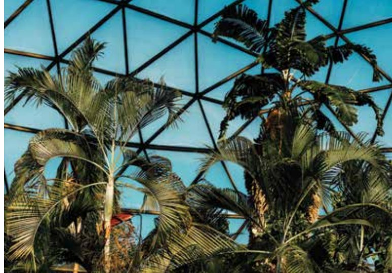
You can participate in Sip and Stroll inside the Des Moines Botanical Garden.

JAN. 7: DMPL and Dragons. Dungeons and Dragons at the