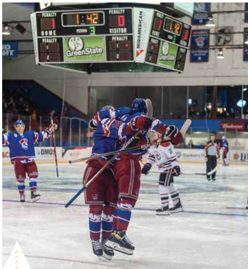
Des Moines Buccaneers.