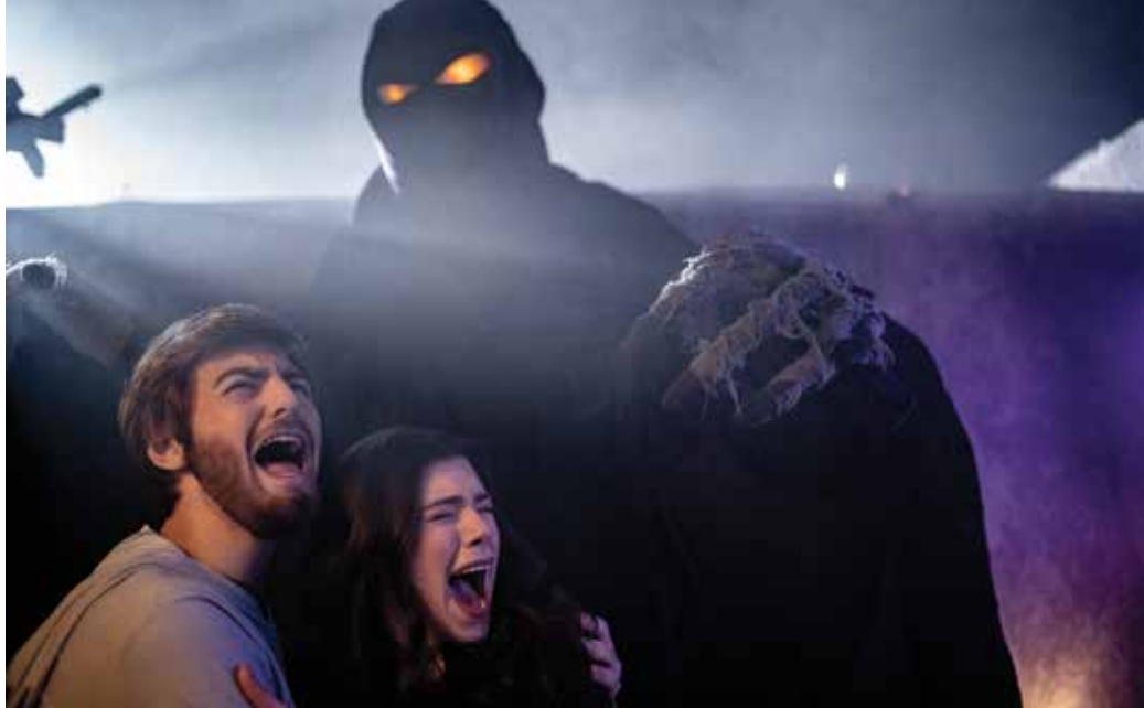
Phantom Fall Festival.

NOV. 1: Live Music Wednesdays. Presented by Republic on Grand, take in live musical performances every Wednesday through December for free. From 6-8 p.m. in the Historic East Village, AC Hotel, 401 E. Grand Ave., Des Moines; therepublicongrand.com .