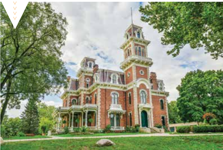
Terrace Hill.

Built by Benjamin Franklin Allen, now the home of the Governor, the first and second floors serve as a museum and are open for tours with an advanced reservation. The iconic residence celebrated its 150th anniversary in 2019 and is a shining example of Victorian Second Empire architecture.