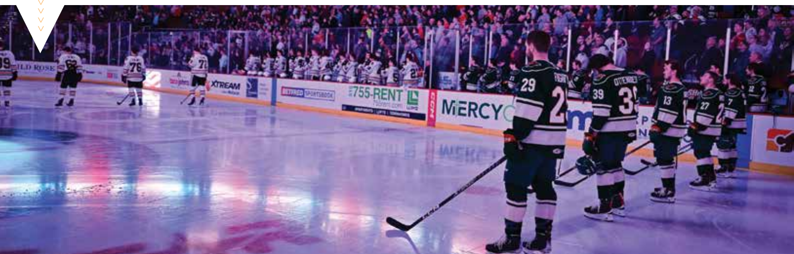
The Iowa Wild lines up during the pregame at Wells Fargo Arena.