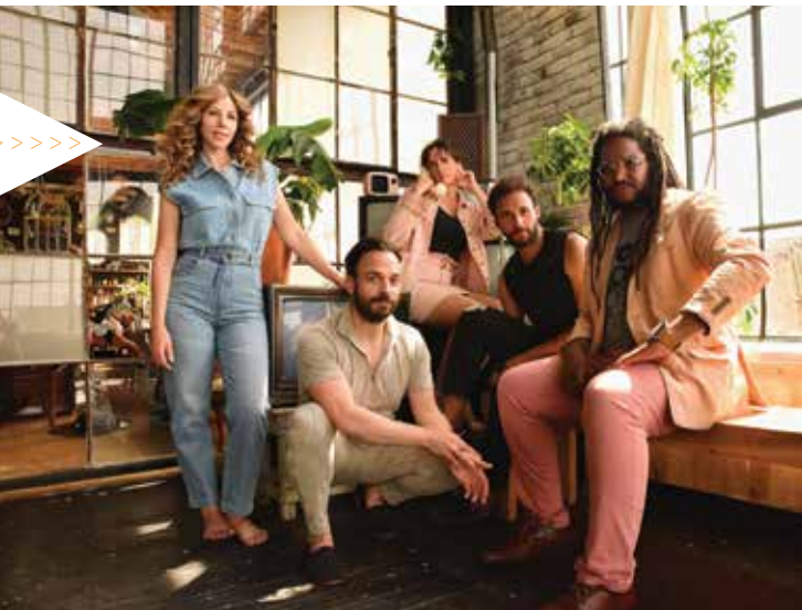
Lake Street Dive will be performing at Hoyt Sherman Place on Nov. 12.