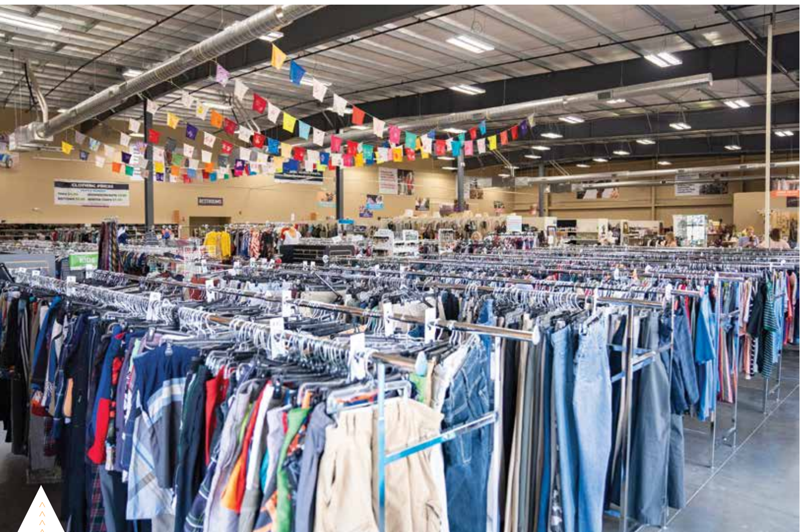
Many Hands Thrift Market's Grimes location.

Shop until you drop, and then shop some more.