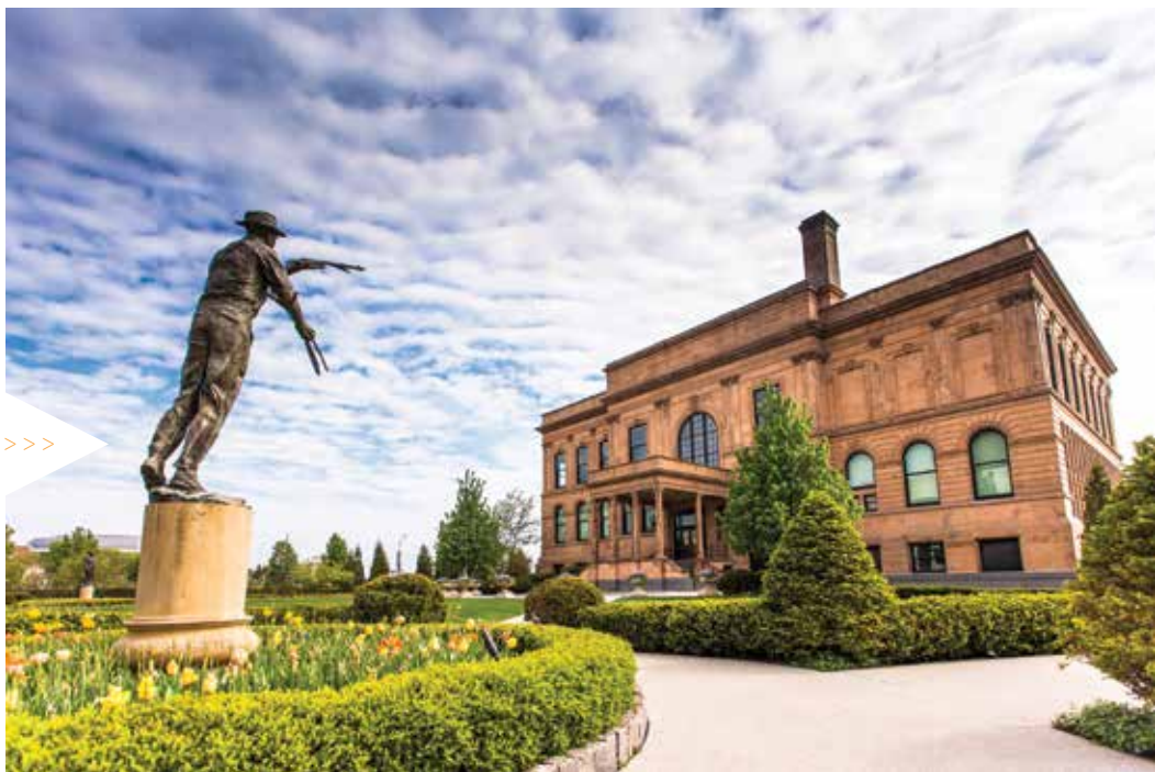
World Food Prize Hall of Laureates.

Extensive restoration took place in 2005 of this beautifully constructed homage to "The King's House" in Salisbury, England. You can experience its unique architecture during the museum's regular hours from Wednesday to Sunday between 10 a.m. and 5 p.m. or get a ticket for a guided tour of the quarters.