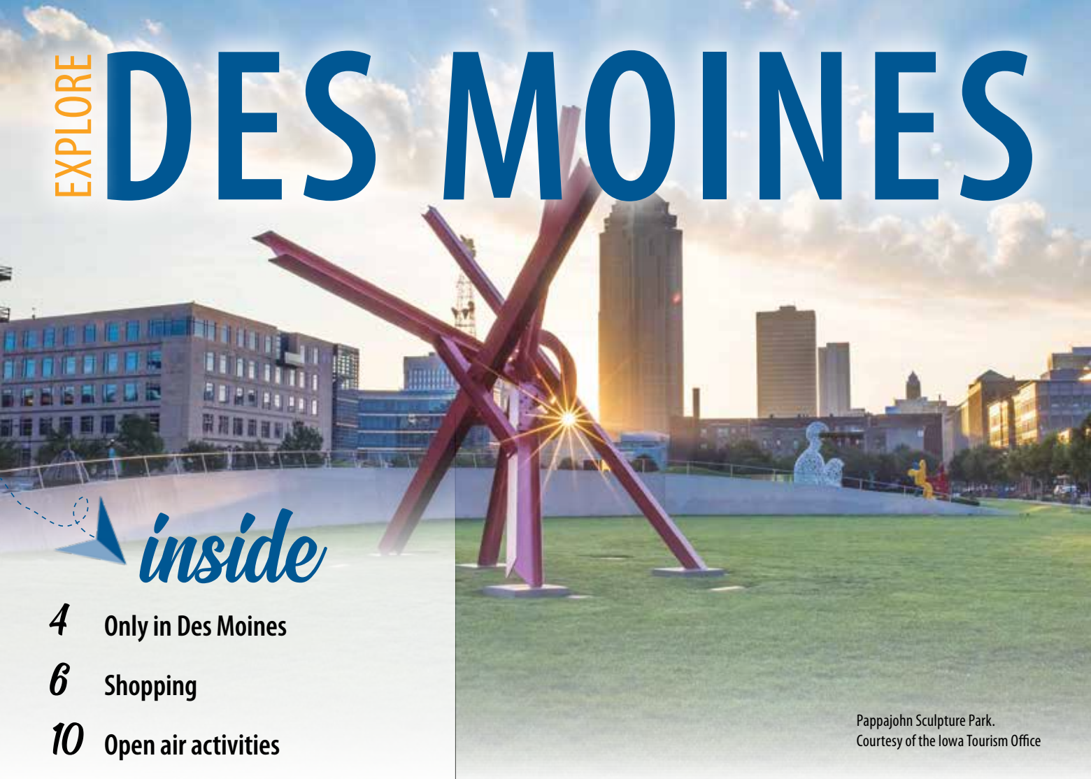
Pappajohn Sculpture Park.