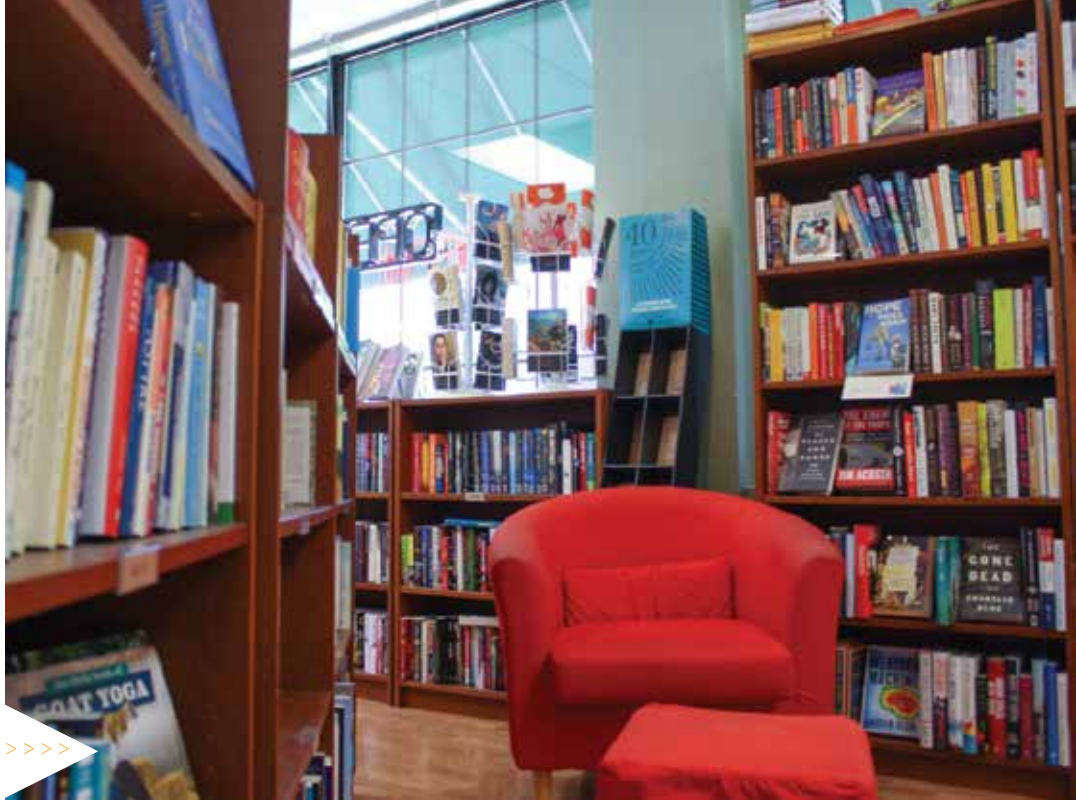
Beaverdale Books.

Voted best bookstore for local or new books by CITYVIEW readers, you'll have no trouble finding page-turners here. Open since 2006, this bookstore has a focus on supporting and promoting local writers and hosts several local author events throughout the year. ■