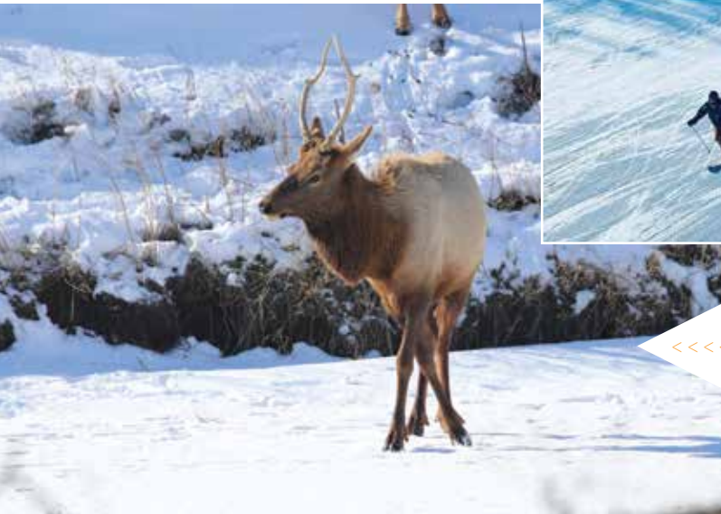
It's possible to see wild furry friends while at Jester Park.