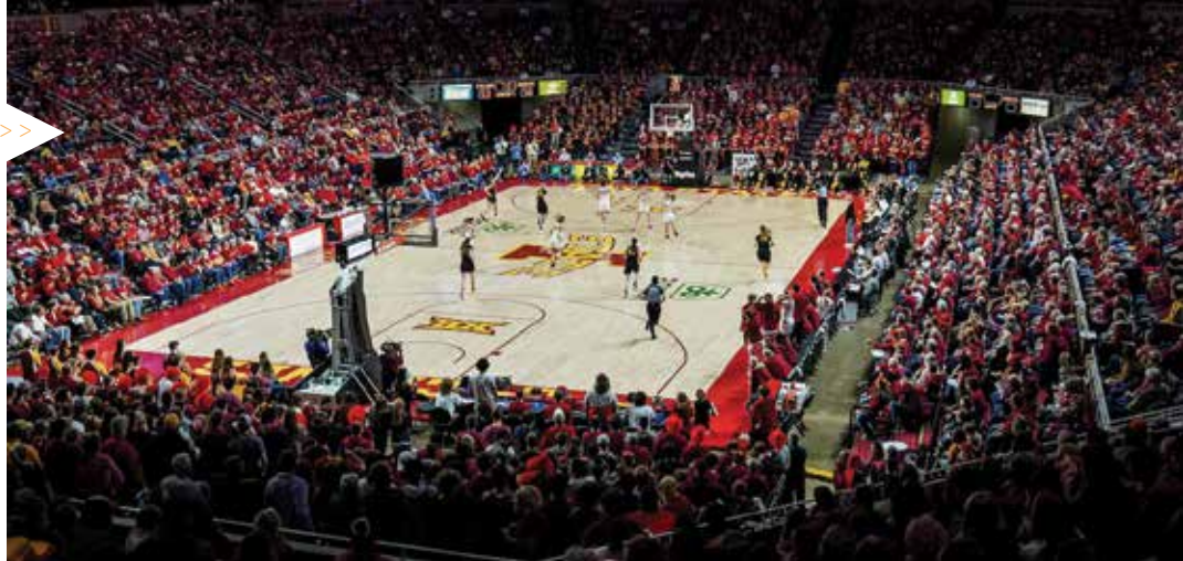
Last year's Cy-Hawk game at Hilton Coliseum.