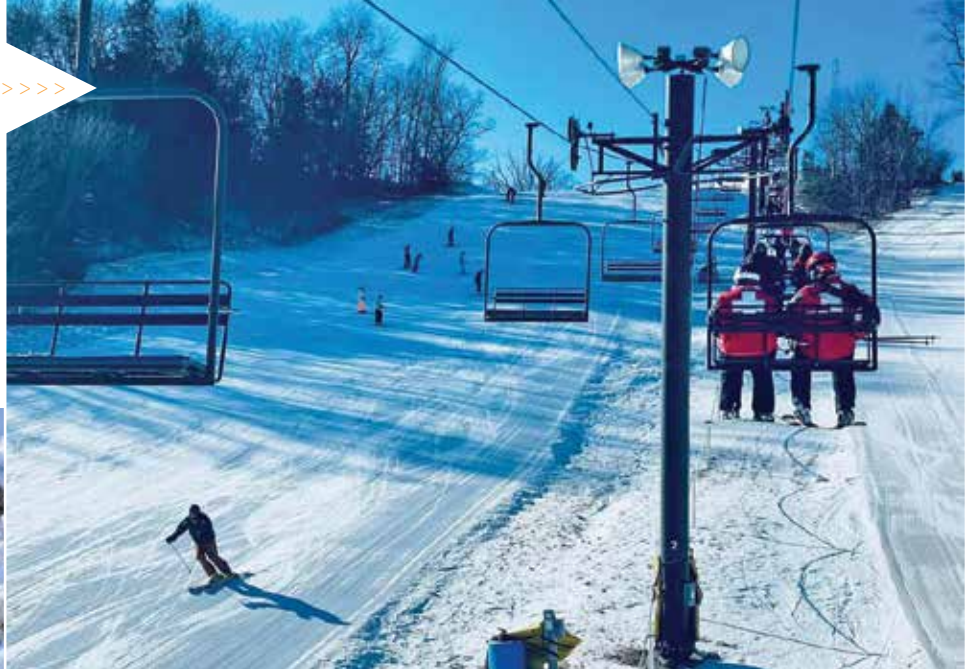
Get on the lift and head back down in style.

Your favorite outdoor winter activities are just under an hour away from Des Moines. Tubing, skiing, sledding, snowboarding and ice skating. Seven Oaks even offers paintball seven days a week with advanced reservations.