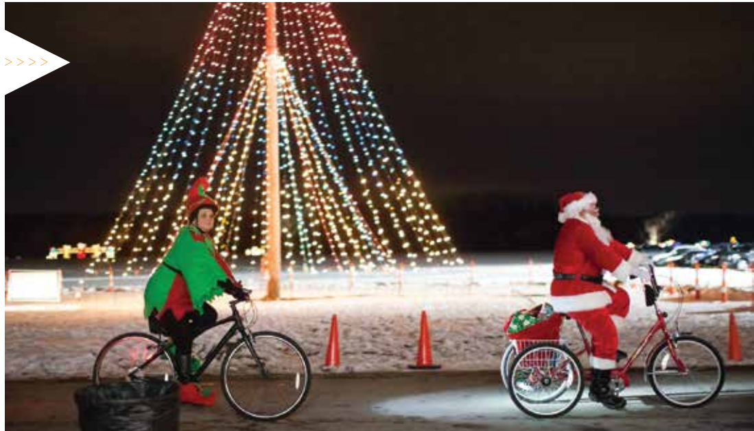
Santa on a ride during Jolly Holiday Lights.