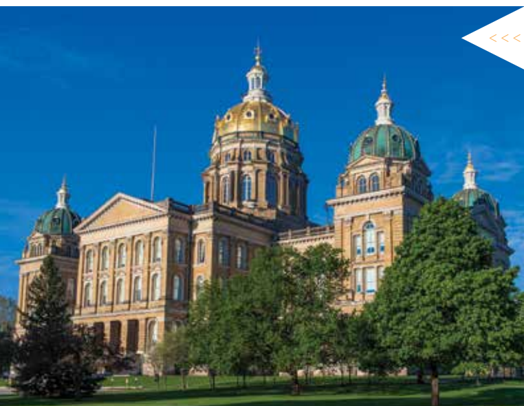
Iowa State Capitol.

Formerly the Des Moines Public Library, the World Food Prize Hall of Laureates now serves as a showcase for expert achievement in agriculture and the fight against hunger. While highlighting successes in the world of food, you can still learn and experience the rich history of the century-old building and witness the breathtaking artwork on display throughout its halls.