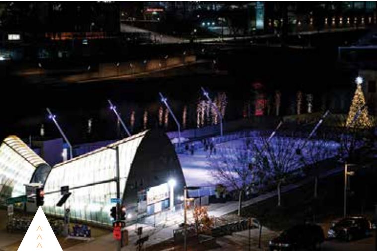
Brenton Skating Plaza, located on the Principal Riverwalk along the Des Moines river, is open from November to March.

Just because the temperatures go down doesn't mean you shouldn't go out.