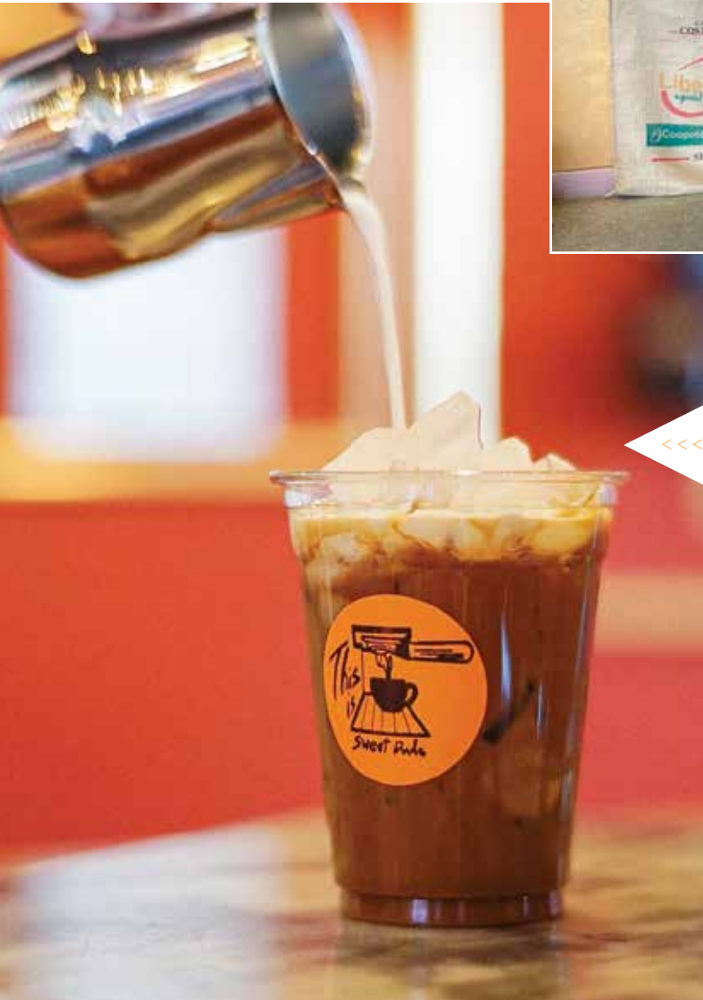
Thai iced coffee at SweetDude Coffee and Cafe.