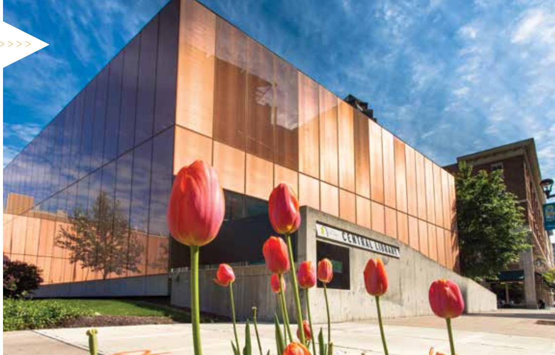
Des Moines Central Library.