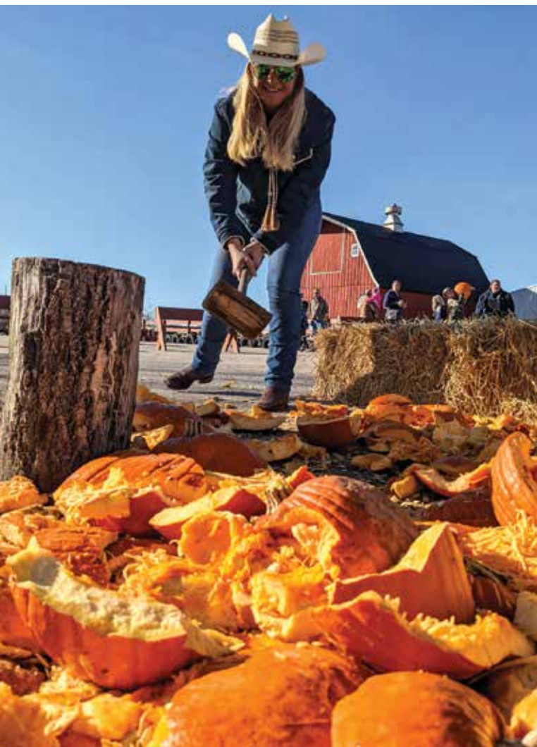
Pumpkin Destruction at Center Grove Orchard.

and bands, what's there not to like? From 11 a.m. to 6 p.m. Raccoon River Valley Park, 2500 Grand Ave., West Des Moines; wdmchamber.org/raccoon-river-rally .