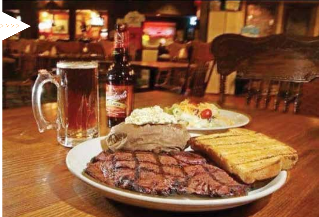
One of several mouthwatering steak options at Iowa Beef Steakhouse.

A destination it is. Each steak is wagyu beef that provides incredible flavor with each bite, helped by their steakhouse broiler oven and pan seared to give your steak a crispy crust. Not limited to the meats, their pizzas also come highly recommended. Choice cocktails are made with top-shelf liquor.