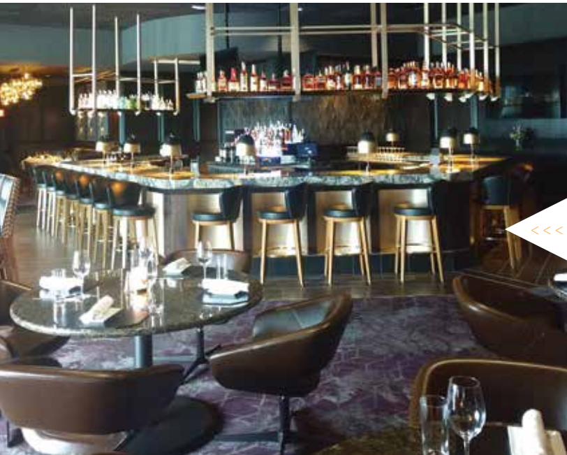
Prepare for indulgence at The new Ruth's Chris Steakhouse.