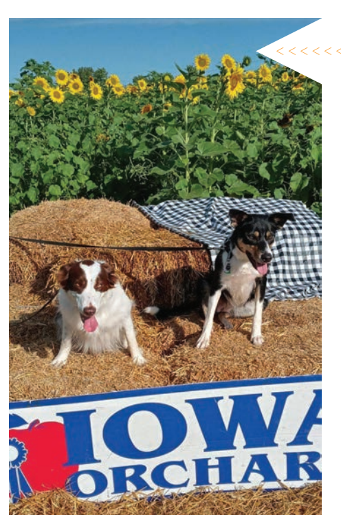
Leashed dogs are welcome at Iowa Orchard's Granger location, which includes fields of sunflowers for visitors to pick through.