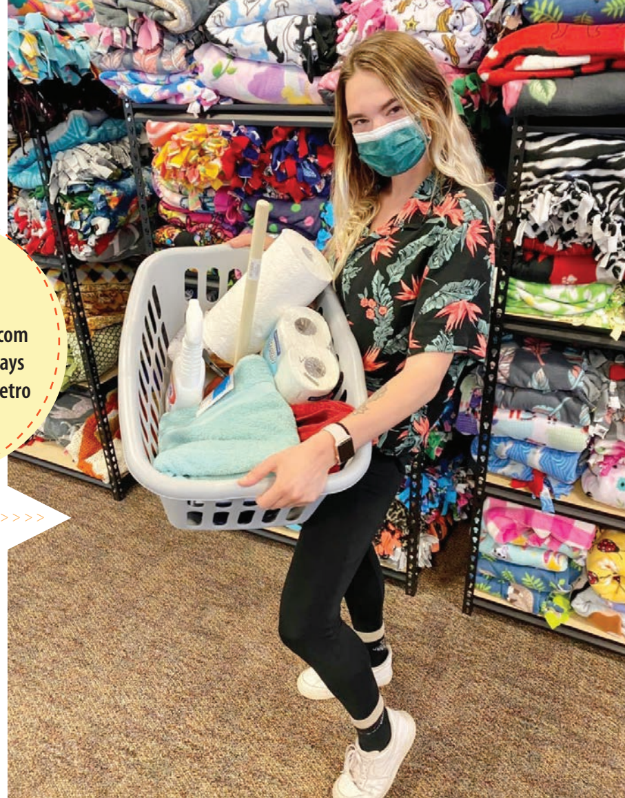
Volunteers are able to put baskets together full of essential items to set up new residents for success when they move in.

The YMCA works to eliminate homelessness by providing housing for 140 men and women. Their "Housing First" model helps people who are homeless, or at-risk, move into stable and secure permanent housing. Case management, transportation assistance, food/clothing/hygiene pantries, rental assistance and other services help residents meet their basic needs and reach their life goals. Volunteers can serve home-cooked meals, organize fun activities for residents or help with facility maintenance as a "Worker Bee."