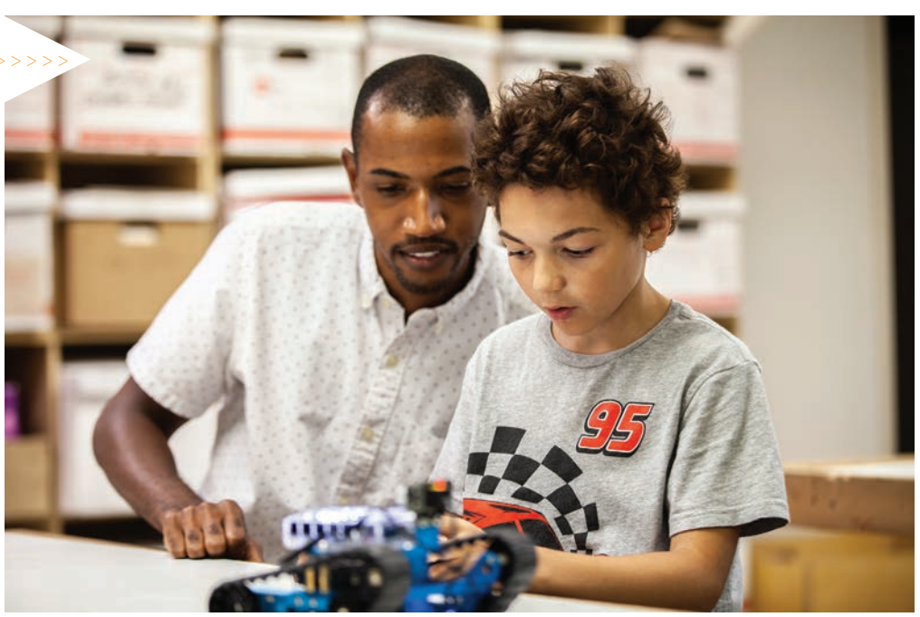
While Bigs and Littles are paired for a year at minimum, some matches continue until the child graduates from high school.

As an interfaith organization, DMARC works to meet the basic human needs in the greater Des Moines community. Volunteers can support this mission by working the mobile food pantry, volunteering at various special events, or sorting, delivering and picking up food donations.