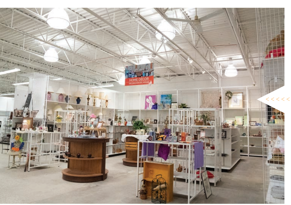
Many Hands donates proceeds from its four thrift stores — three in the Des Moines Metro — to Many Hands for Haiti.