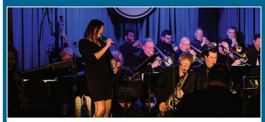
Enjoy cocktails and live jazz music at Noce, Wednesday through Saturday evenings. No cover charge during "Jazz on the House" on Thursday evenings.

There are more live music events happening around Des Moines than we could possibly list. Check out these other live music venues: