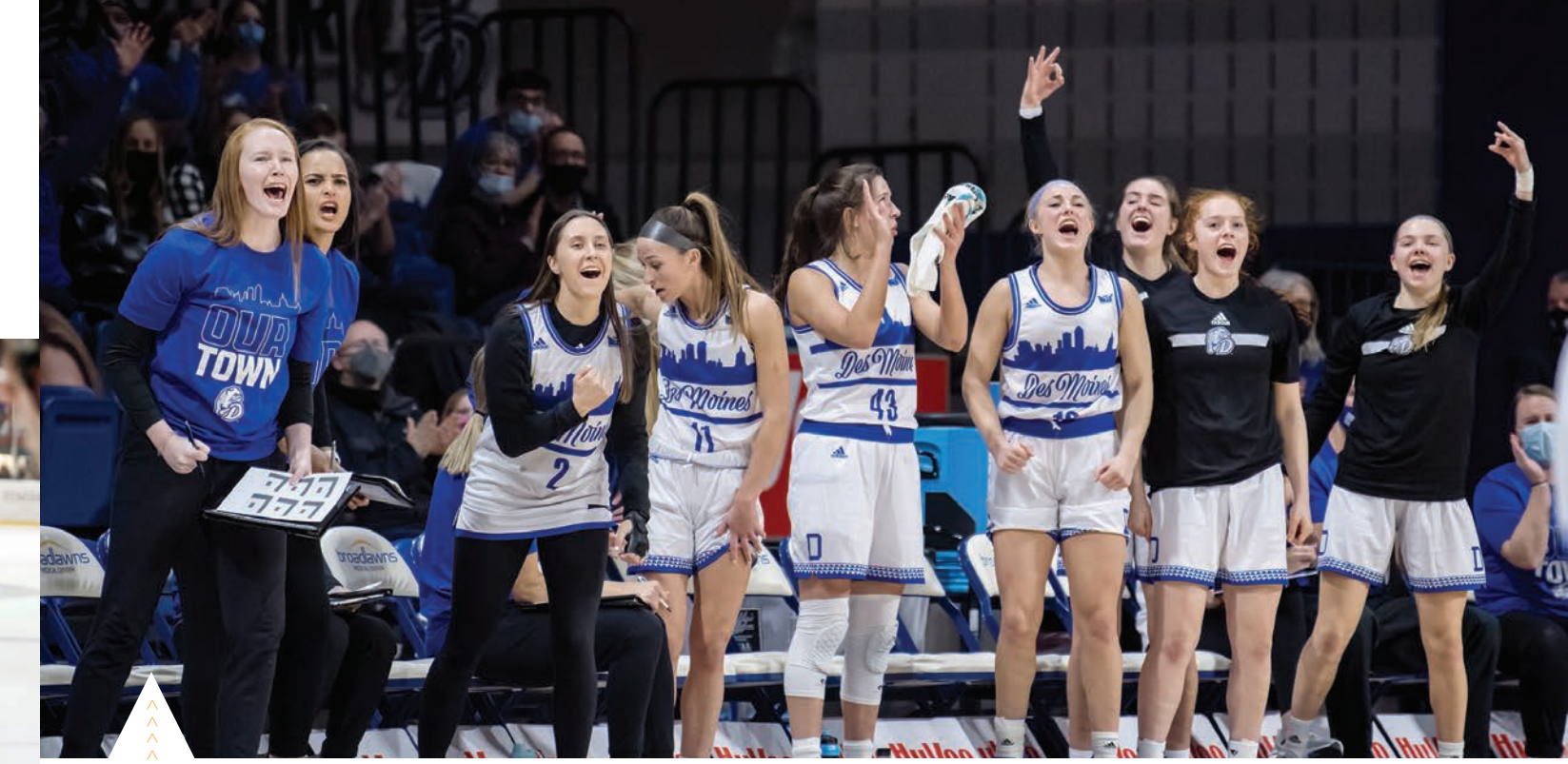
Women's basketball at Drake University.