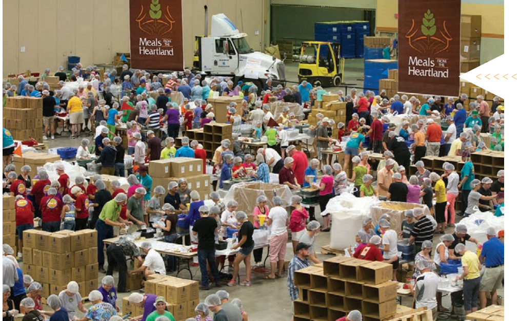
Thousands participate in the Annual Hunger Fight (pictured), but meal-packing volunteer shifts are available weekly at Patty Cownie Packaging Center in West Des Moines.