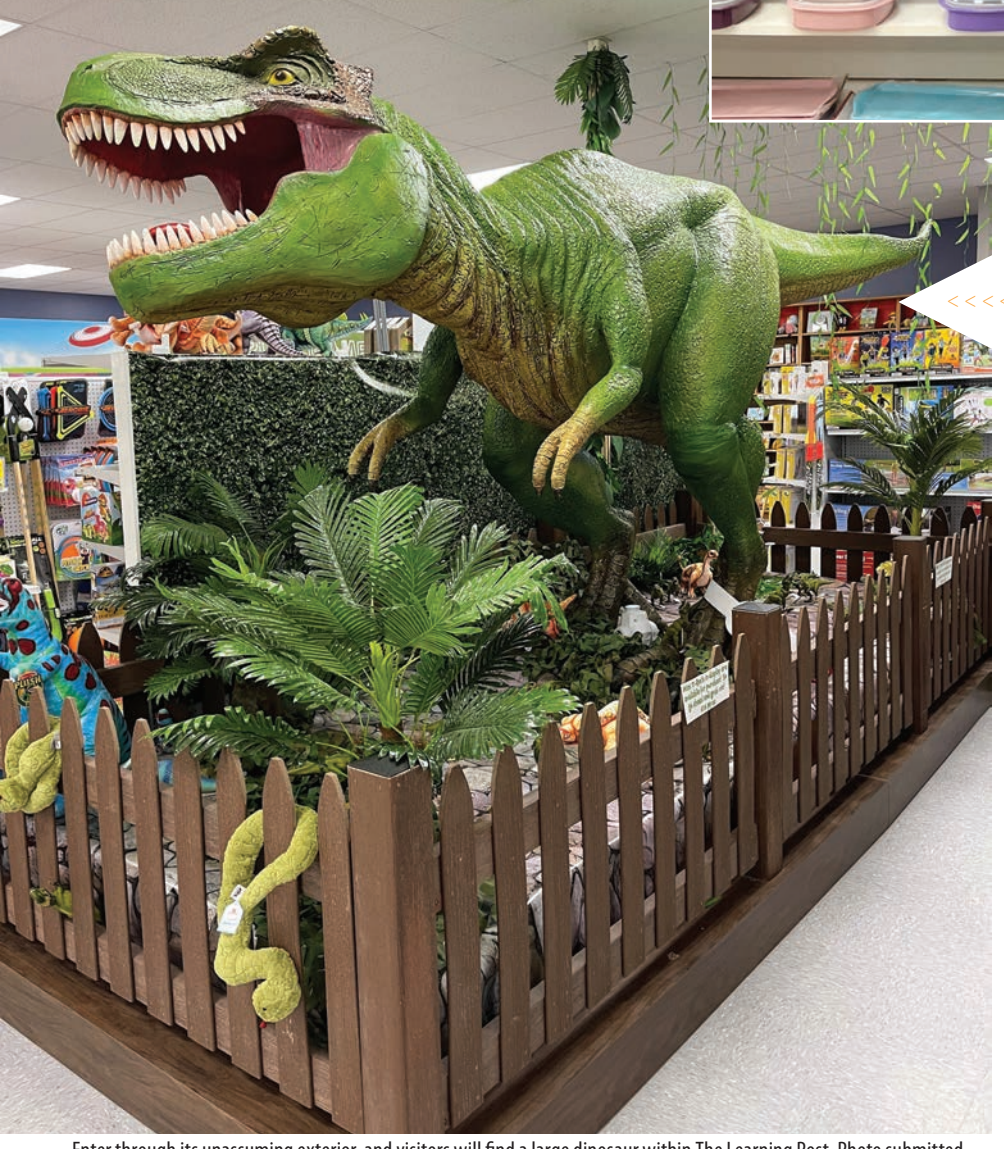
Enter through its unassuming exterior, and visitors will find a large dinosaur within The Learning Post.

A modern resale boutique for women located in West Glen Town Center and the Shops at Roosevelt shopping mall. Sell your unwanted items and update your wardrobe in one place. Voted "Best Local Resale/Consignment Boutique" and runner-up for "Best West Glen Store." ■