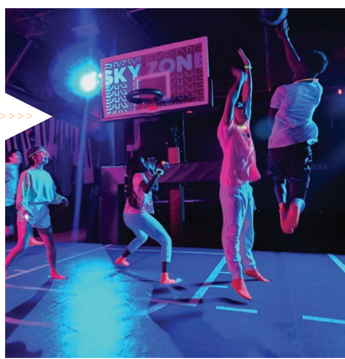
On top of open jump trampolines, Sky Zone includes an air-filled multi-court (pictured), dodgeball, warrior course and more.