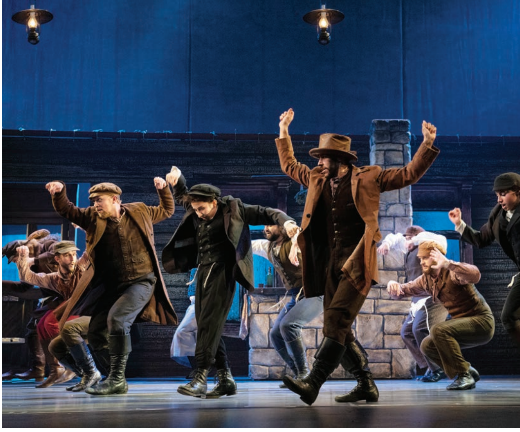
"Come from Away" shows at the Civic Center Nov. 22-27.

NOV. 11: Iliza Shlesinger's "Back in Action" comedy tour at 7 p.m. Des Moines Civic Center; 221 Walnut St., Des Moines; dmpa.org