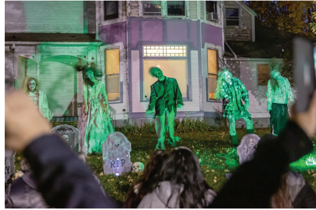
A spooky annual tradition, Halloween on the Hill, showcases the best displays in the Sherman Hill neighborhood.

OCT. 7-8: Halloweenapalooza at the Bridge View Center of Ottumwa. Zombie walk, costume contest, live music,