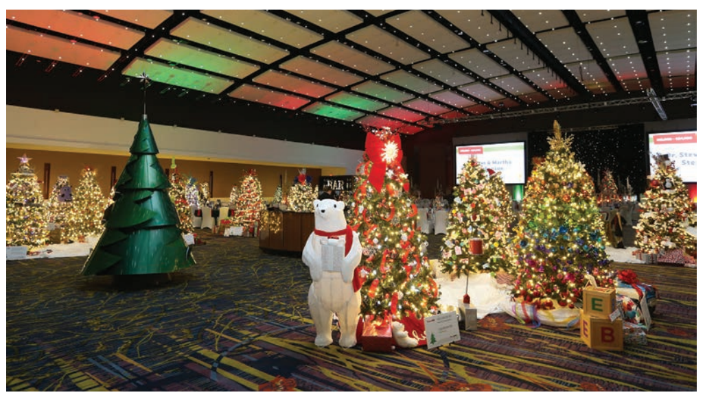
The Festival of Trees and Lights returns to Hy-Vee Hall at Iowa Events Center on Nov. 25-27.

NOV. 30: The Illusionists - Magic of the Holidays at 7:30 p.m. Stephens Auditorium, 1900 Center Drive, Ames; center.iastate.edu/events