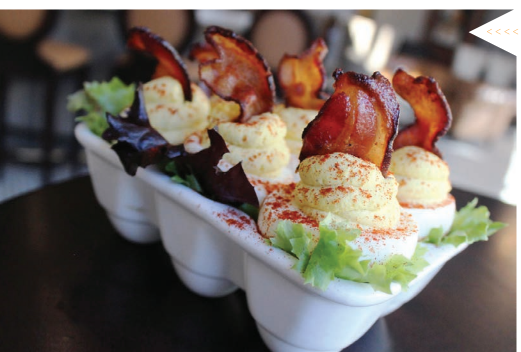
Select $6 appetizers during Bubba's happy hour, which includes deviled eggs topped with pecan-smoked bacon and paprika.