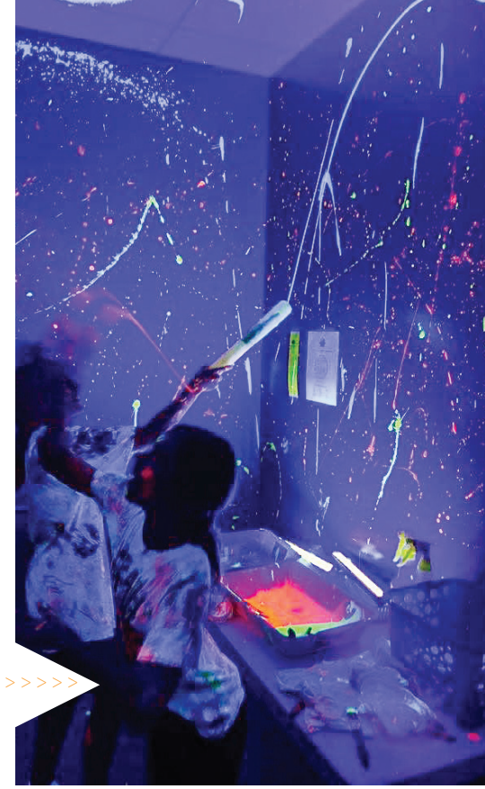
Smash Room lowa offers a glow-in-the-dark splatter room experience.

Have you been harboring repressed rage? Release your anger at one of the smash rooms, where you can use heavy tools to destroy old appliances, windshields, bottles — you can even bring in your own items to smash. Or, tap into your creative and messy side in a splatter paint room.