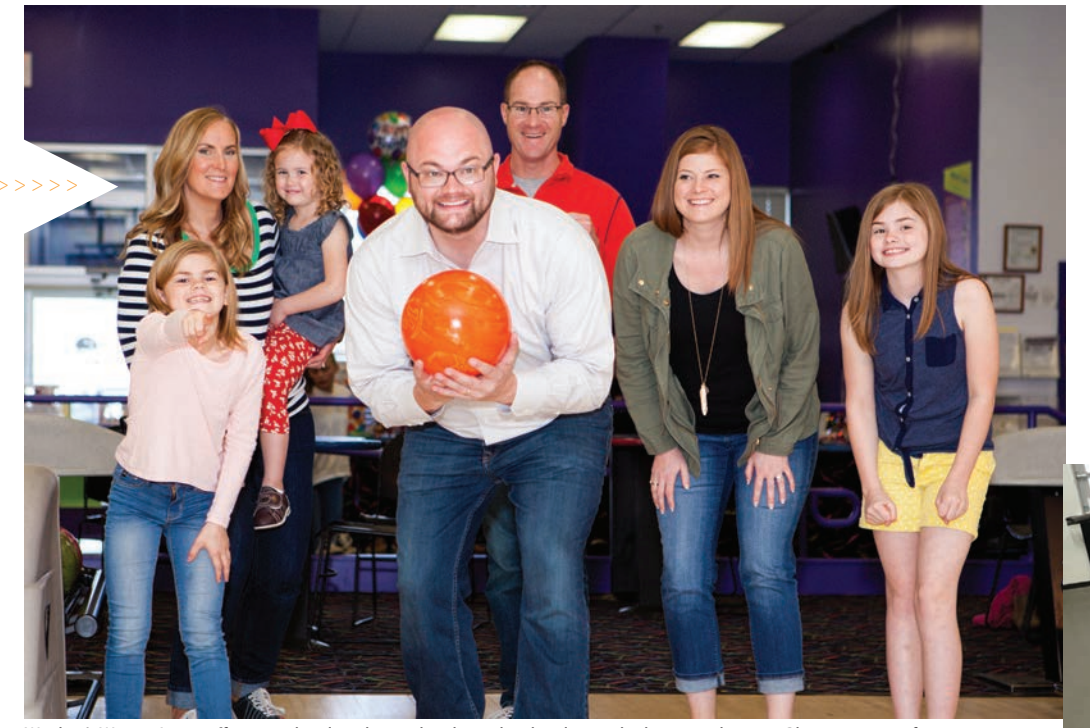
Waukee's Warrior Lanes offers open bowling, league bowling, glow bowling and other special events.

Climb Iowa is the state's largest indoor climbing and training gym. The Grimes location offers walls up to 37.5 feet tall and 200 routes and problems. The Des Moines location in the East Village is a bouldering-only facility with more than 80 problems for climbers to explore.