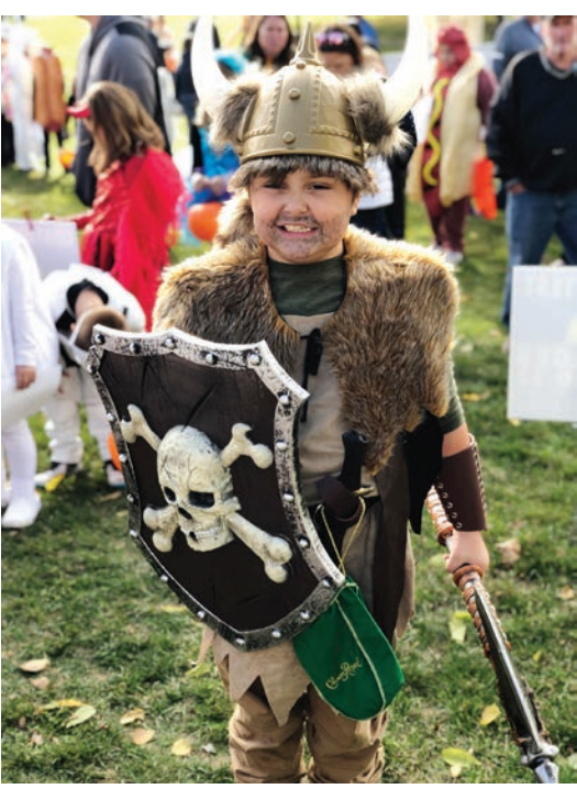
Bondu Spooktacular is scheduled for Saturday, Oct. 22.

OCT. 26: Trick or Treat with First Responders. 5:30-7 p.m. at Fire Station 38, 10225 N.W. 62nd Ave., Johnston, followed by activities and treats at the Bridge Church next door; cityofjohnston.com