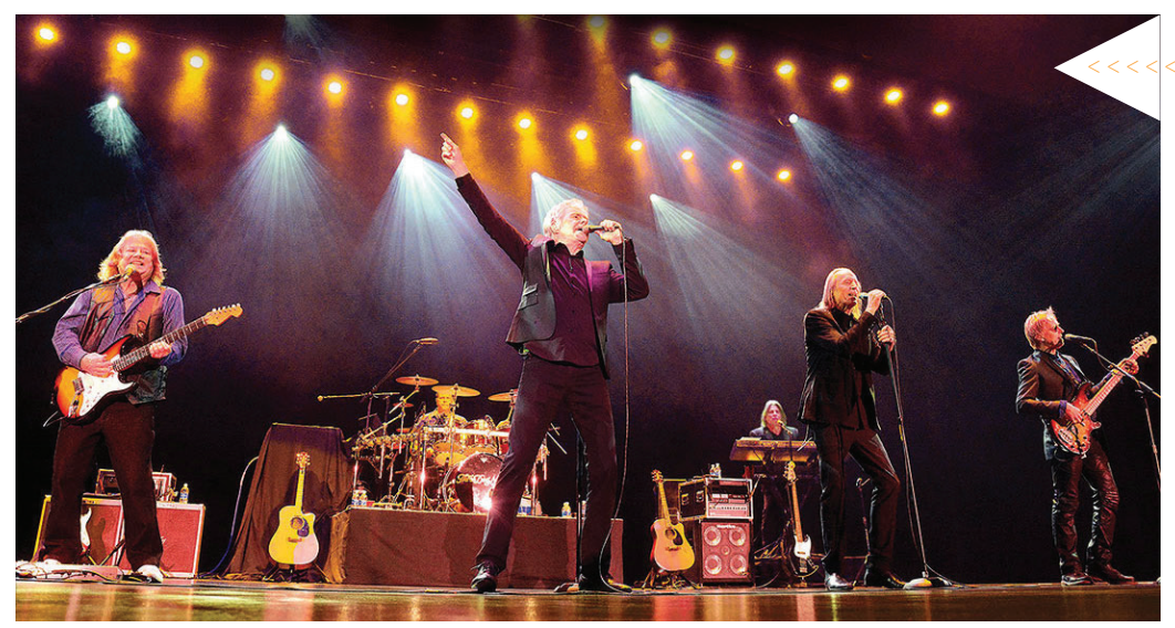
Three Dog Night performs at Stephens Auditorium on Oct. 6. Photo submitted