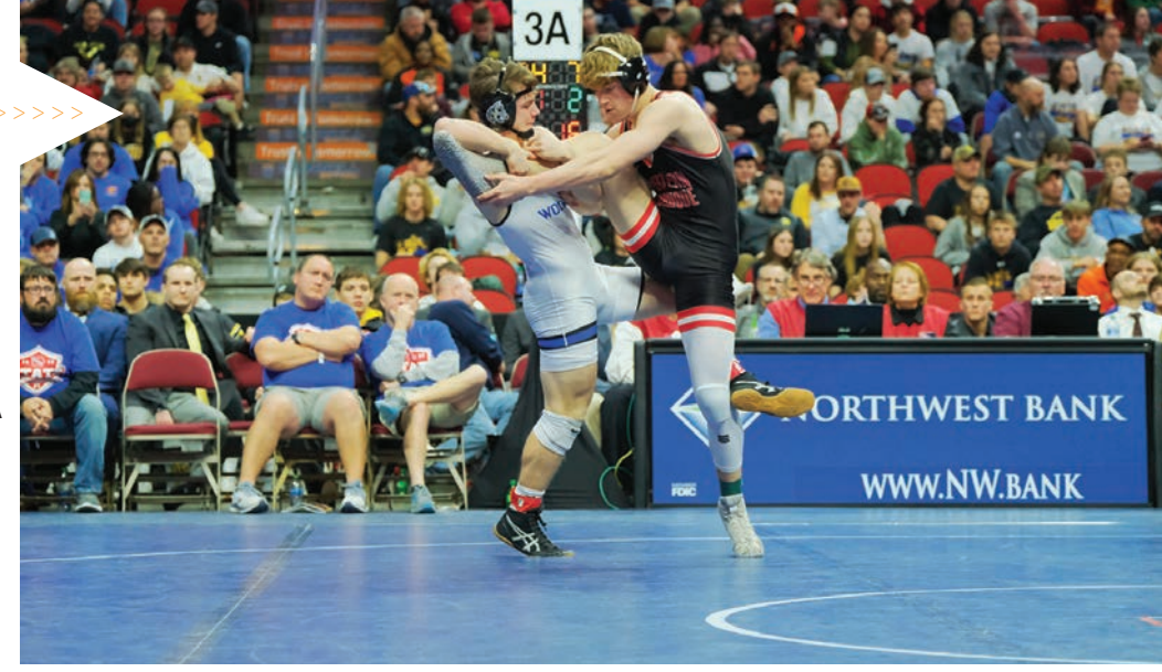
lowa high school state wrestling championships at Wells Fargo Arena in 2022.