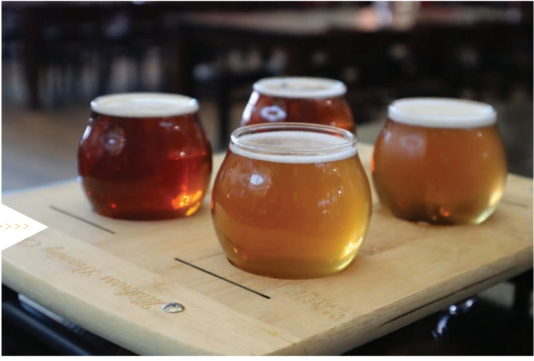
Mistress Brewing Company offers $2 off flights during happy hour.

Receive $1 off pints (any full pour) and $2 off flights all day Tuesdays, 3-7 p.m. Wednesdays and Thursdays, and 3-6 p.m. Fridays. Don't miss their brunch buffet featuring a specialty drink list on Sunday mornings, 10 a.m to 3 p.m.