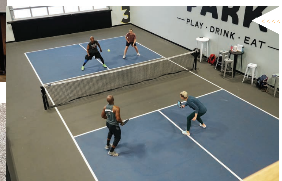
Indoor pickleball at Smash Park.