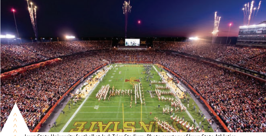
lowa State University football at Jack Trice Stadium.