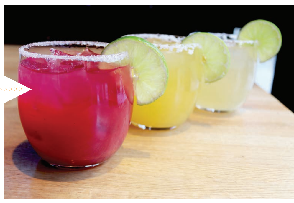
Margarita options at Malo include a choice of agua fresca: lime, raspberry, mango, blueberry, strawberry, white peach, tamarind, passionfruit, hibiscus or jalapeño.

Regular happy hour is 3-6 p.m. on weekdays, with reverse happy hour from 8-10 p.m. Order half-price flatbreads from 5-9 p.m. on Tuesdays and half-price glasses of wine all night Wednesdays. Thursday is Ladies' Night: groups of four or more ladies can enjoy free charcuterie, $7 mules, $7 sangria and half-priced espresso martinis.