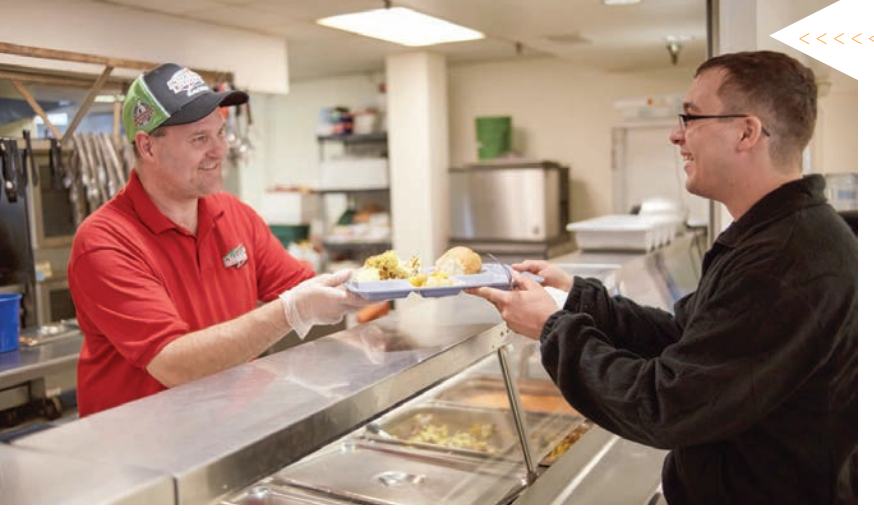
Ongoing volunteer opportunities at Hope Ministries include meal serving, teaching classes, working at the thrift store and more. During the holidays, they'll need 100-plus volunteers to help assemble and deliver meals around the Des Moines area.