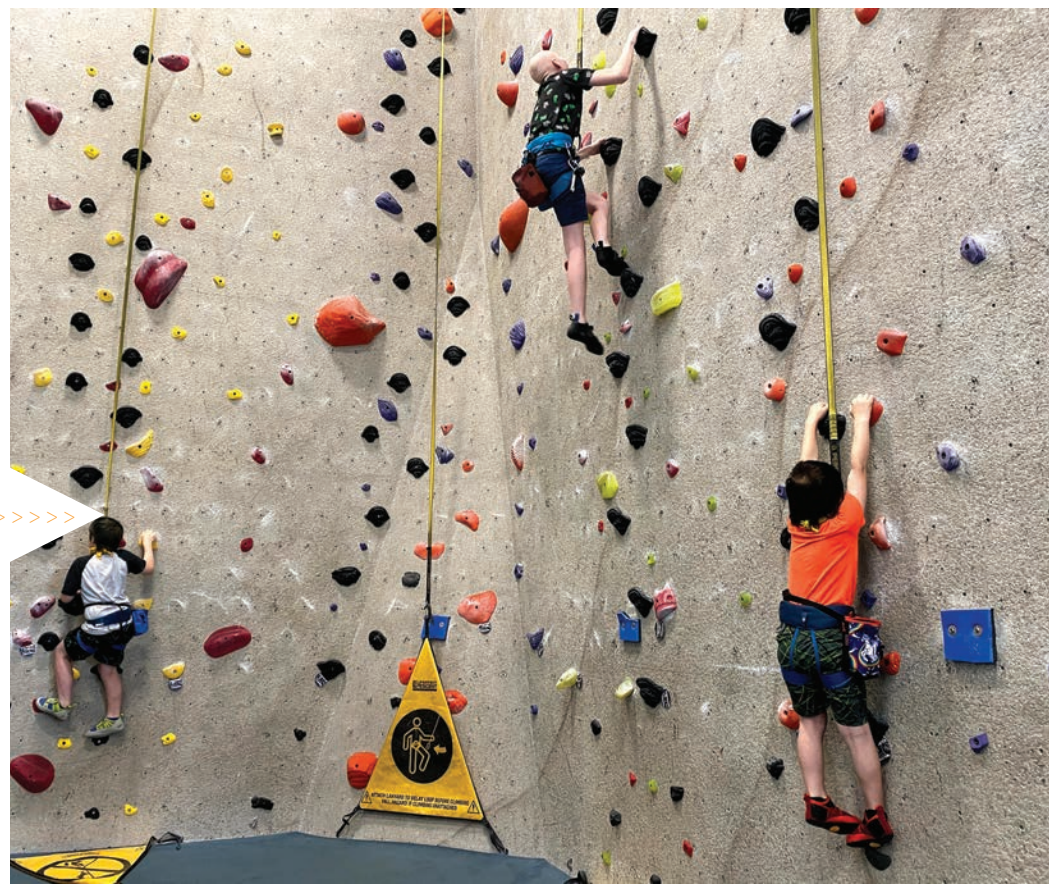
Climb Iowa offers rock climbing activities for all ages and abilities.