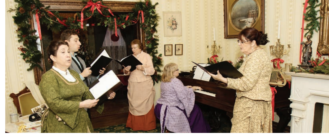
Family Christmas at Living History Farms.

Feet DSM, Santa suits included. 521 E. Locust St., Des Moines; fleetfeet.com/s/desmoines/events