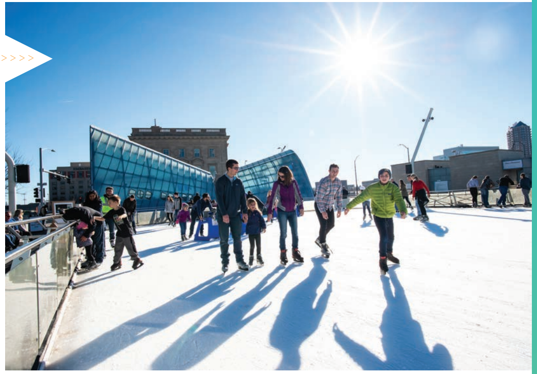
Brenton Skating Plaza is open for ice skating from mid-November to March each season.

Glide your way through a good time — and an excellent workout. Brenton Skating Plaza offers open-air skating with a stunning view of the Des Moines skyline along the Des Moines River. Admission is $9.50 for adults, $5.75 for children and seniors, and free for those younger than age 5. Don't have skates of your own? Rent a pair for $4.50. Open starting Nov. 18, with skating clinics held throughout the season.