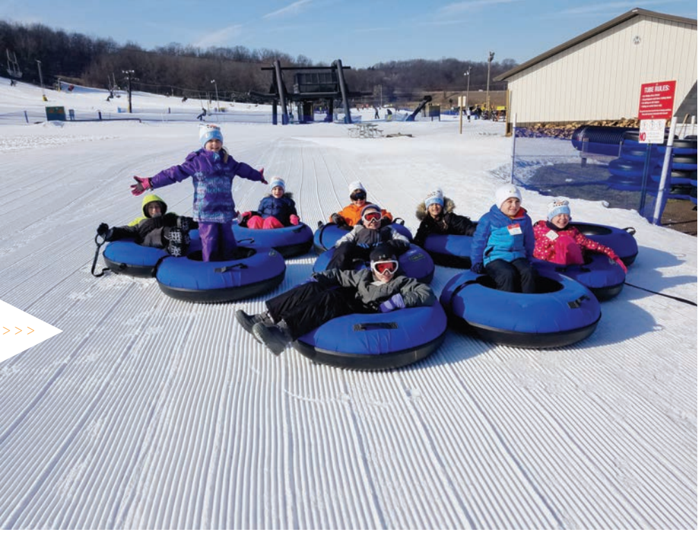
Seven Oaks is a popular destination for all manner of winter sports on the slopes.

Find all sorts of winter recreation less than an hour drive from downtown Des Moines. Seven Oaks offers skiing, snowboarding, snow tubing and more fun activities. Rent equipment on site, and if it's your first time on the slopes, visitors ages 7 and older can take free mini ski and snowboard lessons.