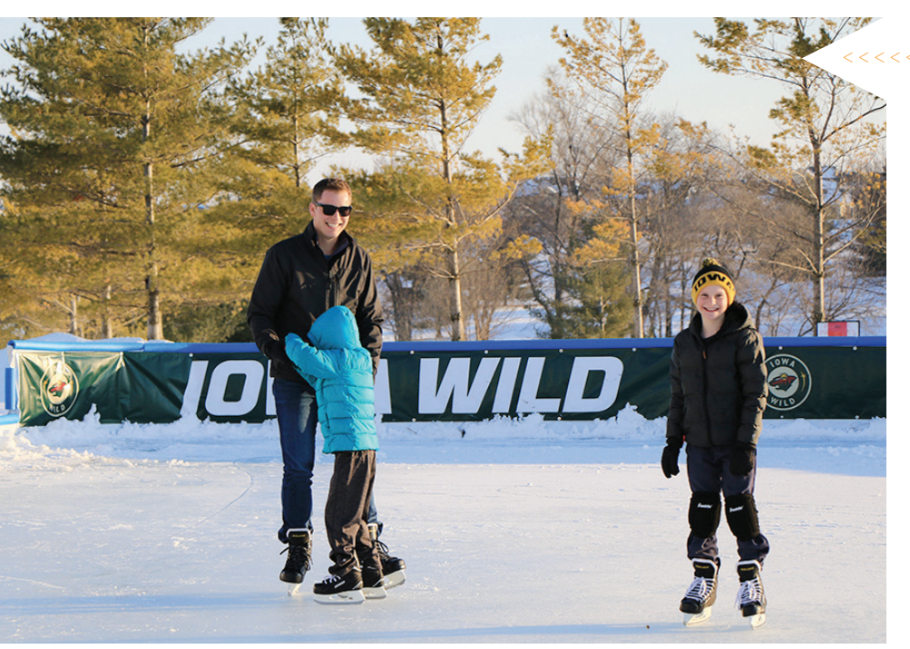
Waukee's Grant Park houses one of several community skating rinks around central lowa.