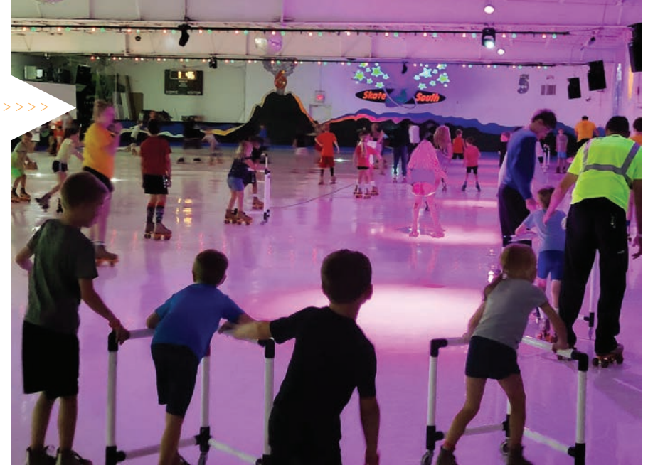
Roller Skating at Skate South.