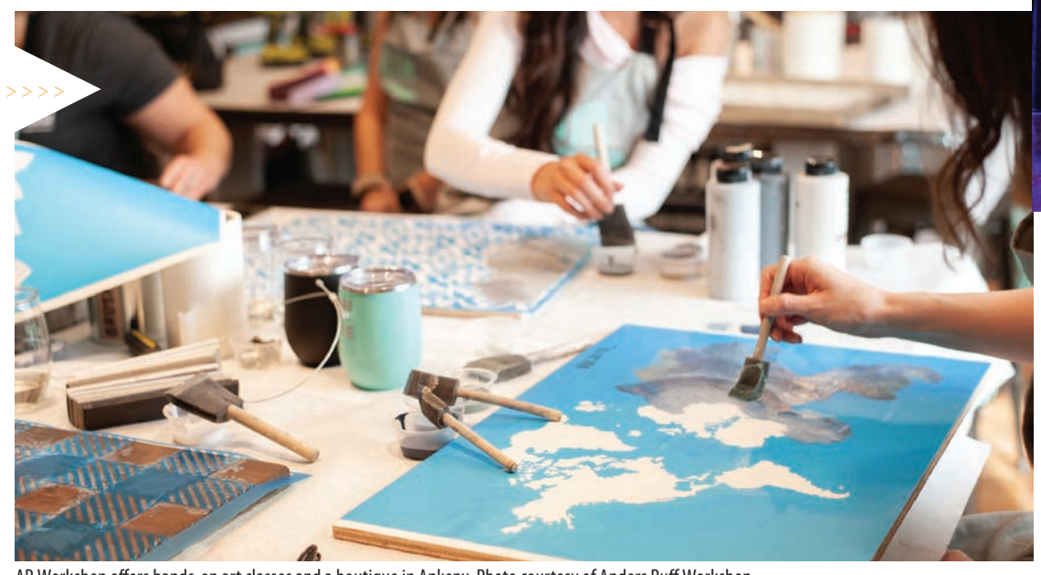
AR Workshop offers hands-on art classes and a boutique in Ankeny.

Porch signs, canvas bags, Christmas ornaments, knit blankets — DIY fanatics will have hundreds of projects to choose from at AR workshop. They provide the materials, tools and instruction. Bring your own wine, beer and snacks to enjoy while you craft!