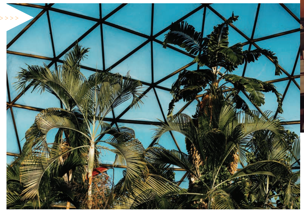
The Des Moines Botanical Garden is open Tuesday to Sunday from 10 a.m. to 5 p.m.

Dust off that red flannel and head to Lumber Axe DSM. An axepert will teach you how to properly throw an axe without dismembering any of your friends. Throwers must be age 16 or older, then 21-plus after 9 p.m. Throwers as young as age 12 are welcome on Sundays. Featuring three concept bars and food.