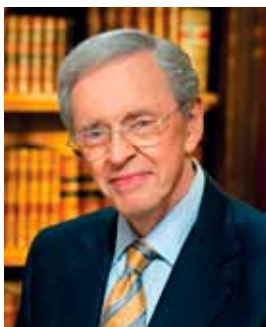
Dr. Charles Stanley In Touch Ministries Atlanta, GA