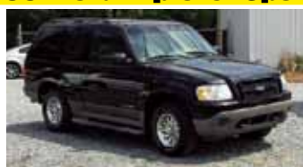
2007 Ford Explorer Sport