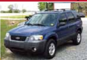
2007 Ford Escape