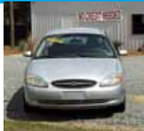
2003 Ford Taurus