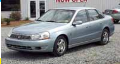
2004 Saturn I200