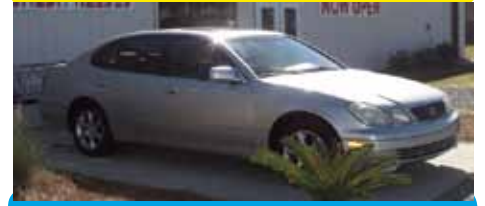
2002 Lexus GS