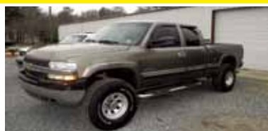
2002 Chevrolet 2500 HD 4WD