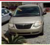
2003 Saturn I 200