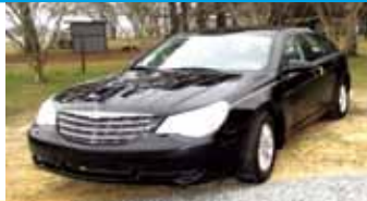
2007 Chrysler Sebring