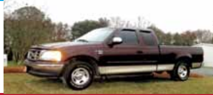
2003 Ford F150 Ext Cab