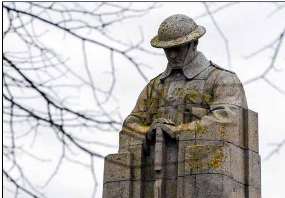
Tree limbs surround the World War One Canadian Memorial, also known as the 'Brooding Soldier' in St. Julien, Belgium on March 7, 2014. The statue is a memorial to the Canadian troops who died in the first gas attacks of the First World War in 1915.

NEED A CAR? No Credit Required. CAR NATION Coolidge, GA 229-346-3033