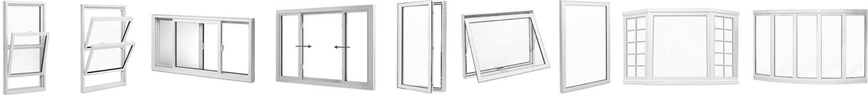
Single-Hung (SH) Double-Hung (DH) Slider (SL) 3-Lite End-Vent (EV) Casement (CA) Awning (AW) Picture (PW) BAY BOW

Exterior color of windows: tan/light brown