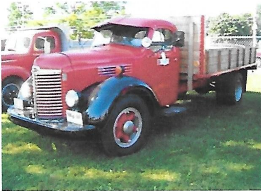
1949 International KB-6

It is approx. 3 miles from the Packerville Road Stop sign to the Haul of Fame Museum. Watch for " Willimantic Waste " on the left.