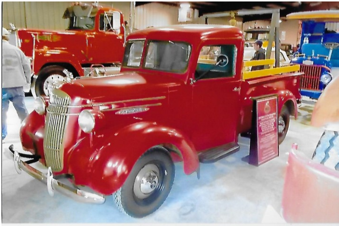
More Photos from the Haul of Fame Museum