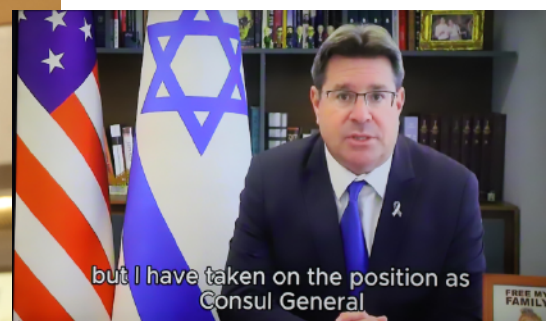
Consul General of Israel in New York, Ofir Akunis, address the audience via video.