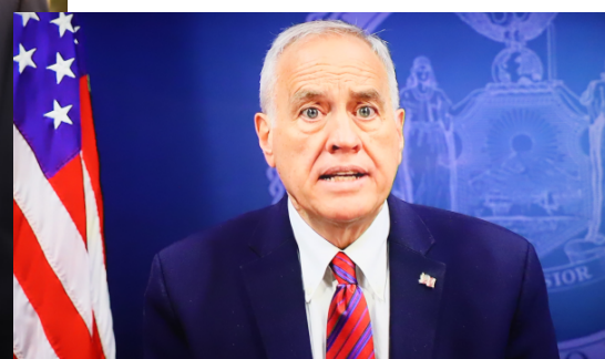
NY State Comptroller, Tom DiNapoli, address the audience via video.