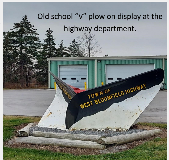
Old school "V" plow on display at the highway department.

Well, that's about all from me. The next time I write, it'll be springtime and the birds will be singing! As always, if you have questions, give me a call at 585-624-2900