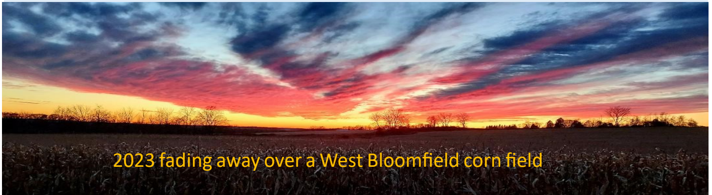
2023 fading away over a West Bloomfield corn field

Please consider our First Responders this winter. Make sure your house number is visible and can be seen from the road. Help our firefighters by clearing the fire hydrant on or near your home. Don't let them waste time digging out the hydrant while your home burns! Have a healthy and happy Winter season. We will see you in the Spring.