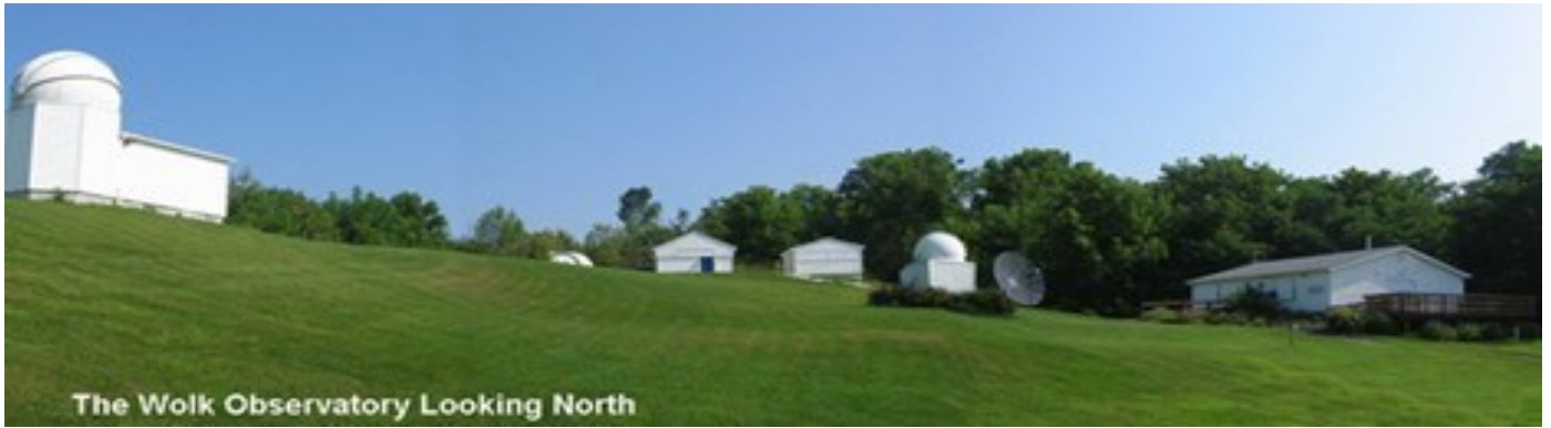
The Wolk Observatory Looking North