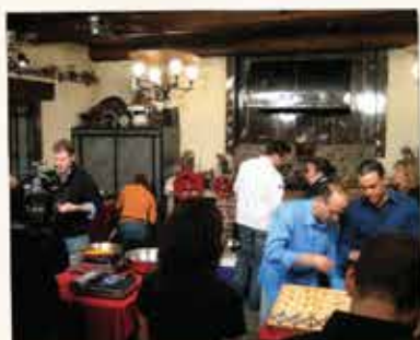
Behind the scenes during the Throwdown! taping