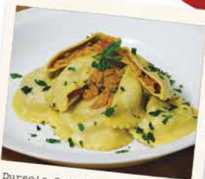
Durso's Osso Buco Ravioli stole the show...WOW!