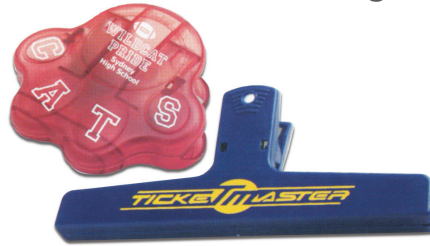
BAG CLIPS starting at ¢.64