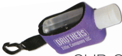
CLIP-ON HAND SANITIZER starting at $1.00