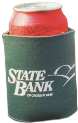
BEVERAGE HOLDERS starting at ¢.50