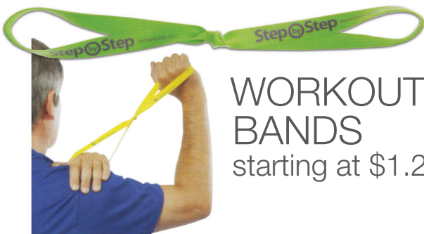
WORKOUT BANDS starting at $1.25