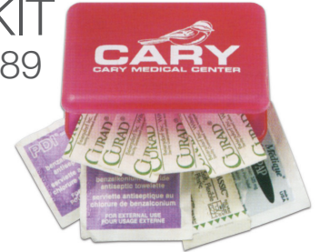
FIRST AID KIT starting at $1.89