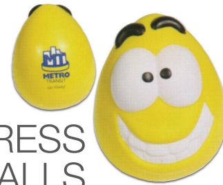
STRESS BALLS starting at ¢.87