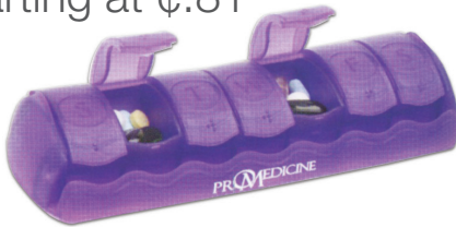
PILL BOXES starting at ¢.81