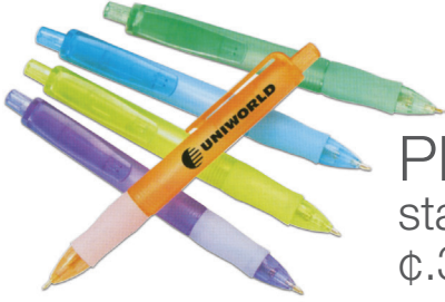
PENS starting at ¢.32

You may purchase items for your ourLife booth from ECM Publishers Promotional Products Division. Below is a small sampling of items available. We can help you with everything from banners and shirts to displays and novelty handouts!