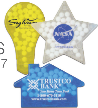
MINTS starting at ¢.87