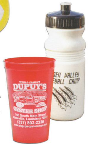
STADIUM CUPS & WATER BOTTLES