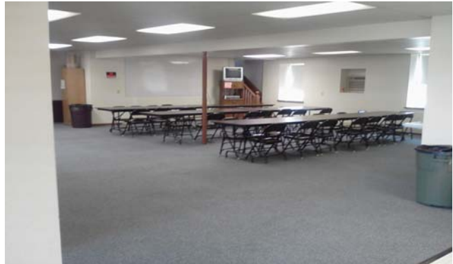
Memorial Hall Meeting Room 40-50 persons easily