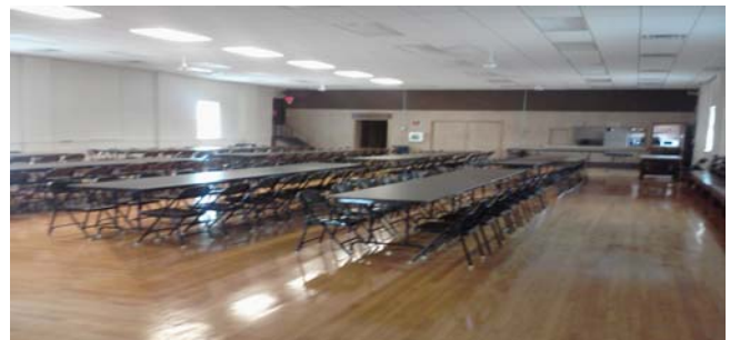
Memorial Hall Upstairs—225-250 persons