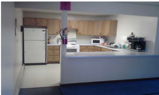
Memorial Hall Meeting Room Kitchen