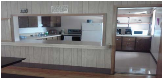
Memorial Hall Upstairs Kitchen

Don't forget that Memorial Hall & the Meeting Room can be rented & they are both air-conditioned! Call the city office for information today on rental rates! Weddings, Bridal Showers, Birthdays, etc.