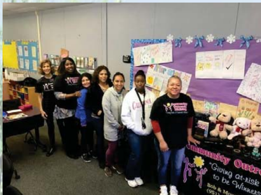
Author: Children's Liberation from Incarceration

Venga y aprenda por si mismo o para aconsejar o ayudar a otros