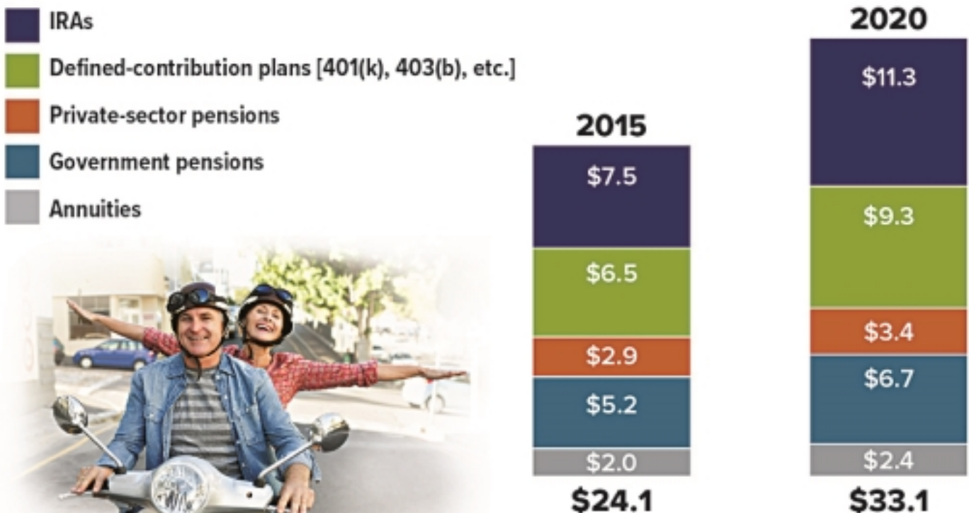
U.S. total retirement market assets (in trillions)

Individual retirement accounts are the largest pool of U.S. retirement assets, which totaled $33.1 trillion at the end of the third quarter of 2020.