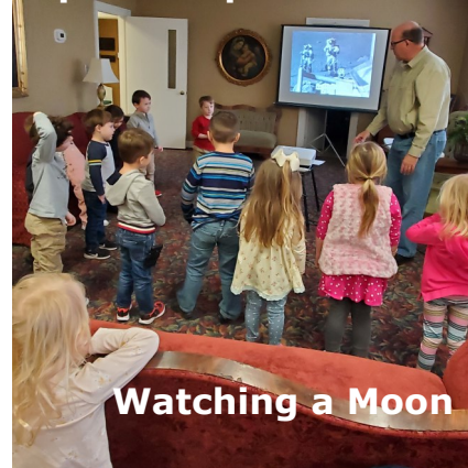
Watching a Moon