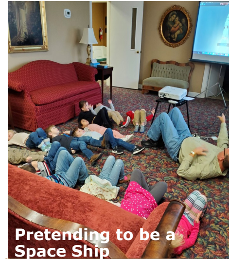
Pretending to be a Space Ship