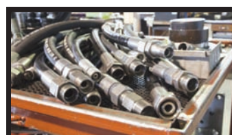
Bridgestone Hoses & Fittings