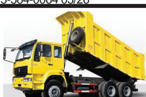
Lift Cylinder Repair