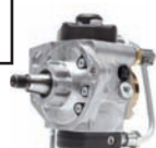
All Brands Gear, Vane Piston Pumps