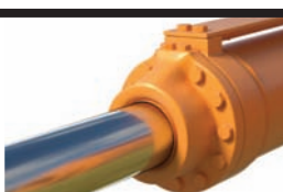
All Types of Cylinders