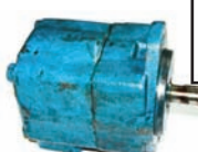
All Brands Hydraulic Motors