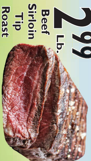
Beef Sirloin Tip Roast