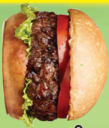
81% Lean Ground Beef Family Pack