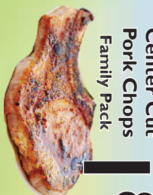
Center Cut Pork Chops Family Pack