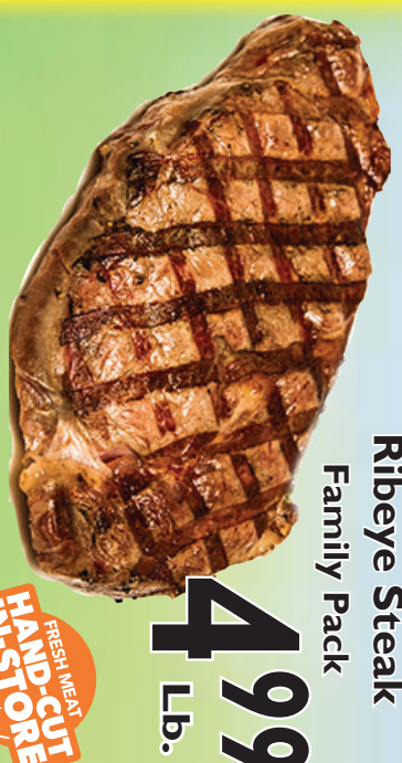
Ribeye Steak Family Pack