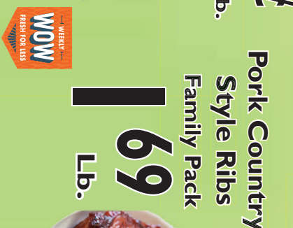
Pork Country Style Ribs Family Pack