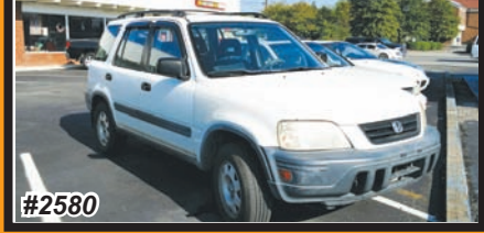
2001 HONDA CR-V LX