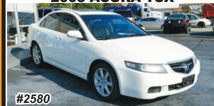
2005 ACURA TSX