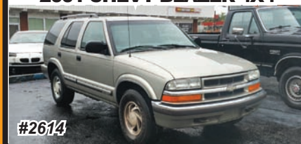
2001 CHEVY BLAZER 4X4