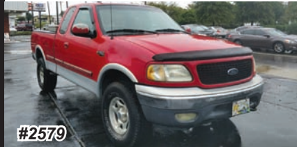
1997 FORD F150 • 1 OWNER!