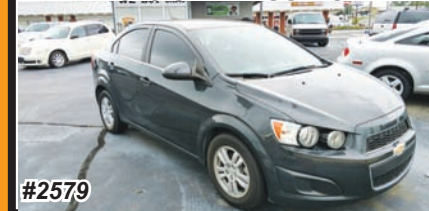
2015 CHEVY SONIC