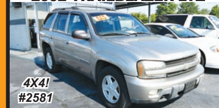
2002 TRAILBLAZER LTZ