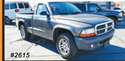
2004 DODGE DAKOTA