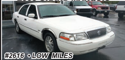
2005 GRAND MARQUIS