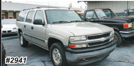
2006 CHEVY SUBURBAN