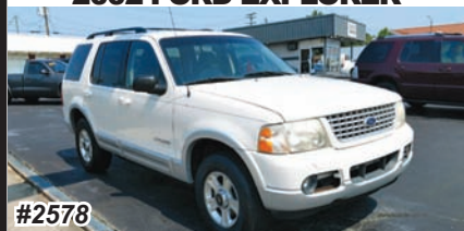
2002 FORD EXPLORER