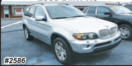
2005 BMW X5