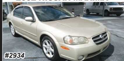
2002 NISSAN MAXIMA