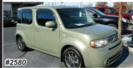
2009 NISSAN CUBE SL