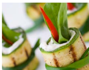
ENJOY CREATIVE COOKING CLASSES

PARKING! convenient and easy! • $10 at nissan stadium multiple shuttles running all day long