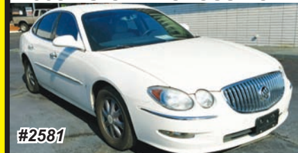
2008 BUICK LACROSSE CXL