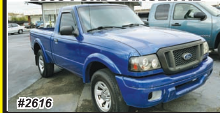
2005 FORD RANGER XL