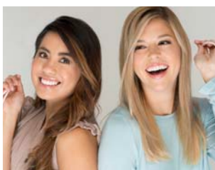
SHOP 'TIL YOU DROP all weekend