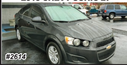
2015 CHEVY SONIC LT