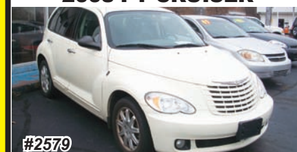
2008 PT CRUISER