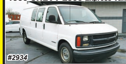
1999 CHEVY 2500 Express Van