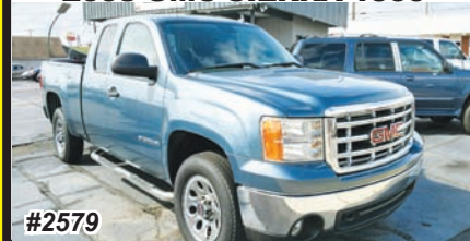
2008 GMC SIERRA 1500