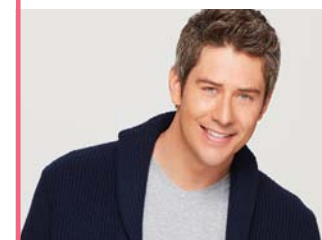
MEET ARIE LUYENDYK from the bachelor

thu 10a-7p fri 10a-8p sat 10a-7p sun 11a-6p