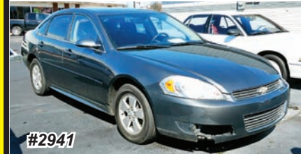
2011 CHEVY IMPALA