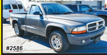
2004 DODGE DAKOTA