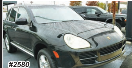
2004 PORSCHE CAYENNE S