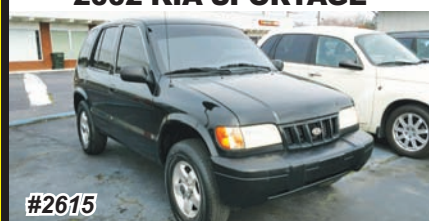
2002 KIA SPORTAGE