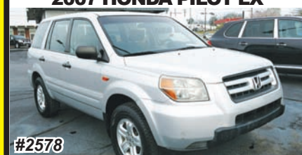
2007 HONDA PILOT LX