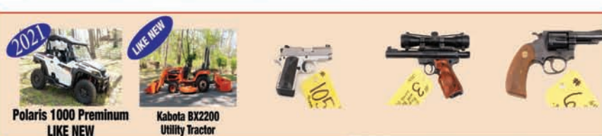
2021 Polaris 1000 Premium LIKE NEW