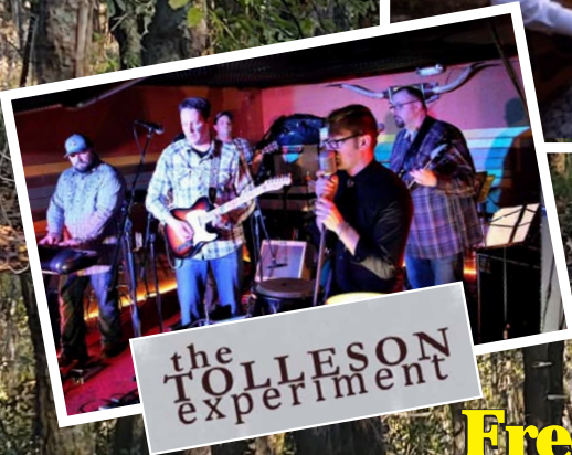
the TOLLESON experiment