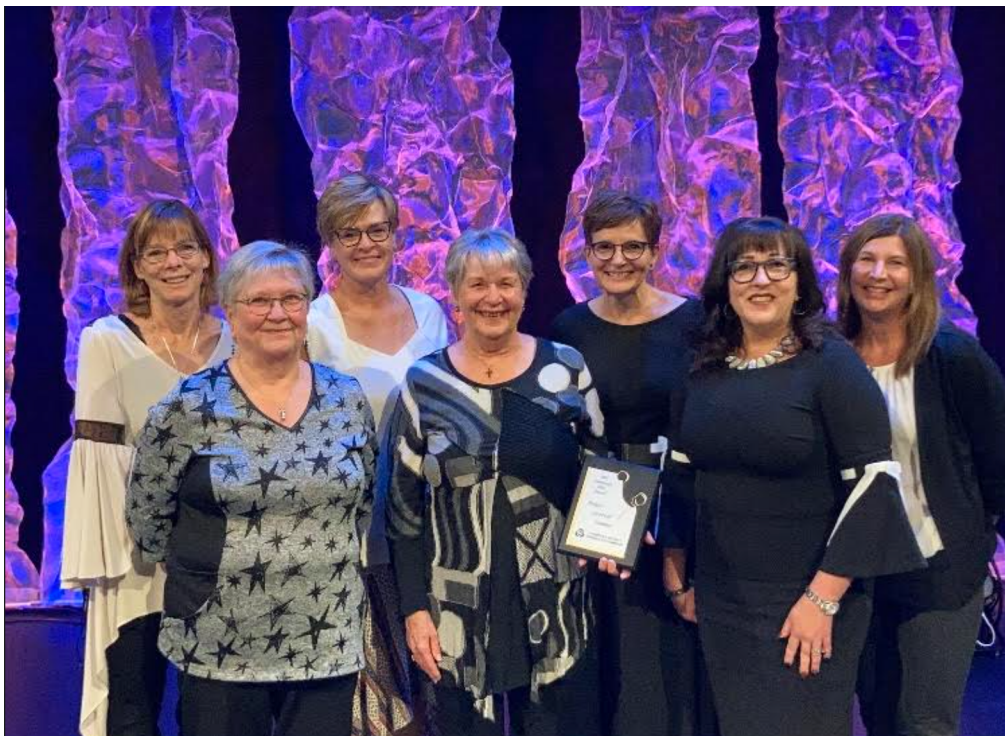
A happy group of HSCD Board members and staff accepting the 2021 Spirit of Excellence Award on behalf of Hospice - October 7, 2021