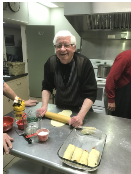
Men's cooking circle