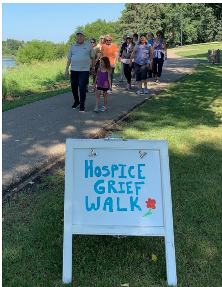
Grief support walking group

Contact the office to book a staff member or volunteer to bring a Hospice presentation to your organization.